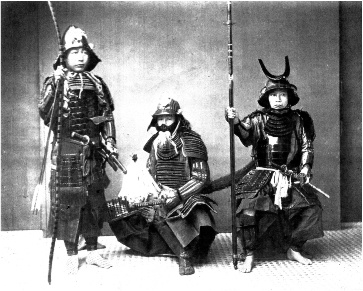
A photograph of Samurai in the 1890s.