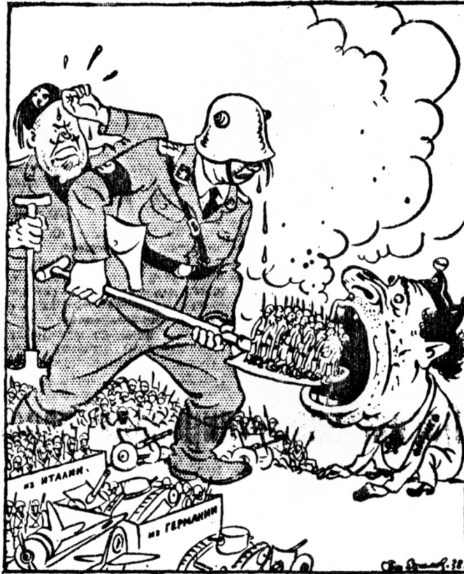
Рис. Бор. Ефимова.