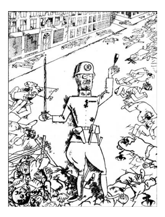
A picture of a Free Corps officer by a German artist. The officer is saying, 'Cheers Noske! The young revolution is dead.'