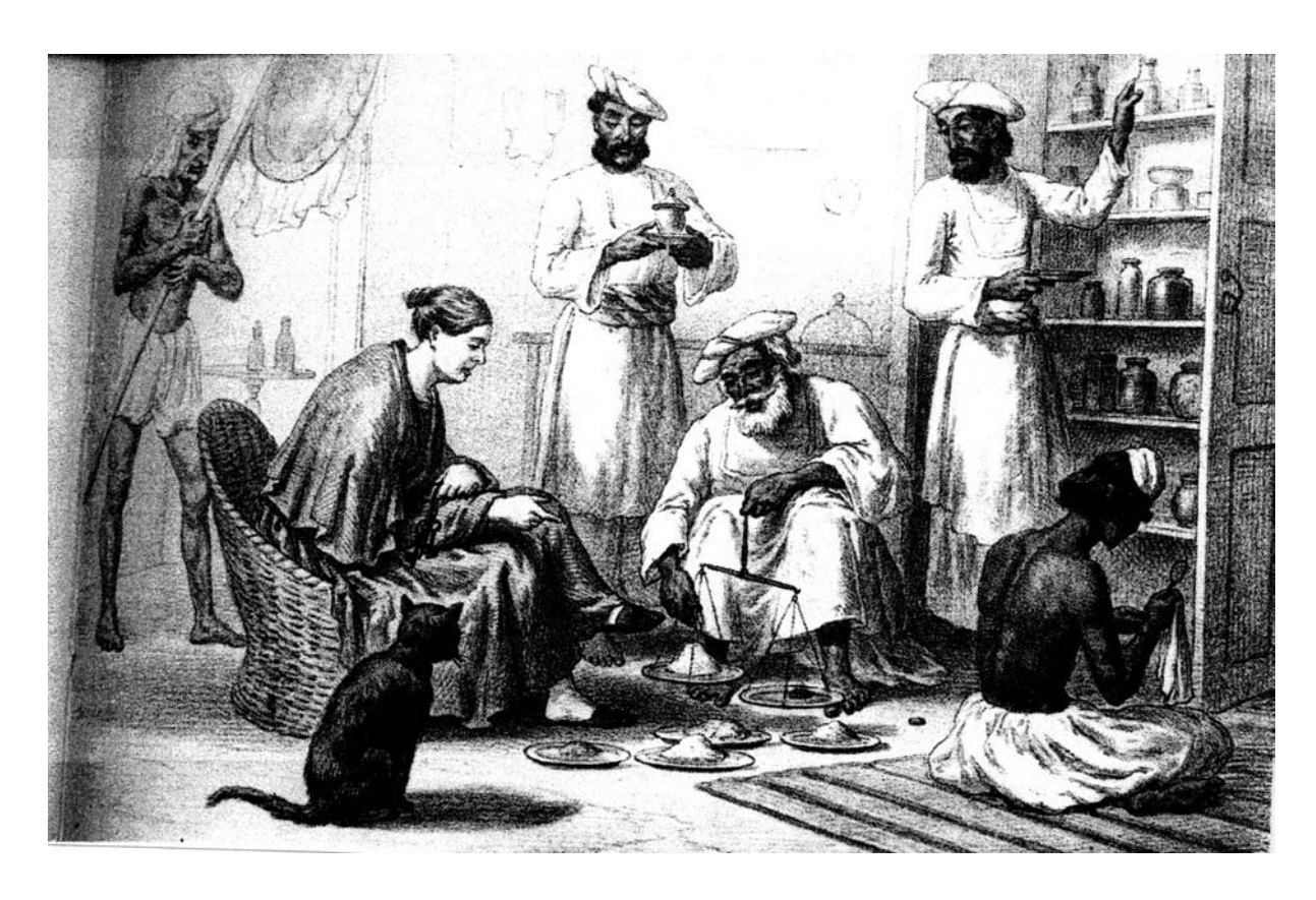
A judge's wife in early nineteenth-century India surrounded by her servants.