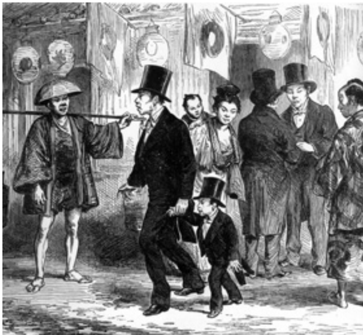
A cartoon published in a British magazine in the second half of the nineteenth century. It shows some Japanese wearing western fashions.