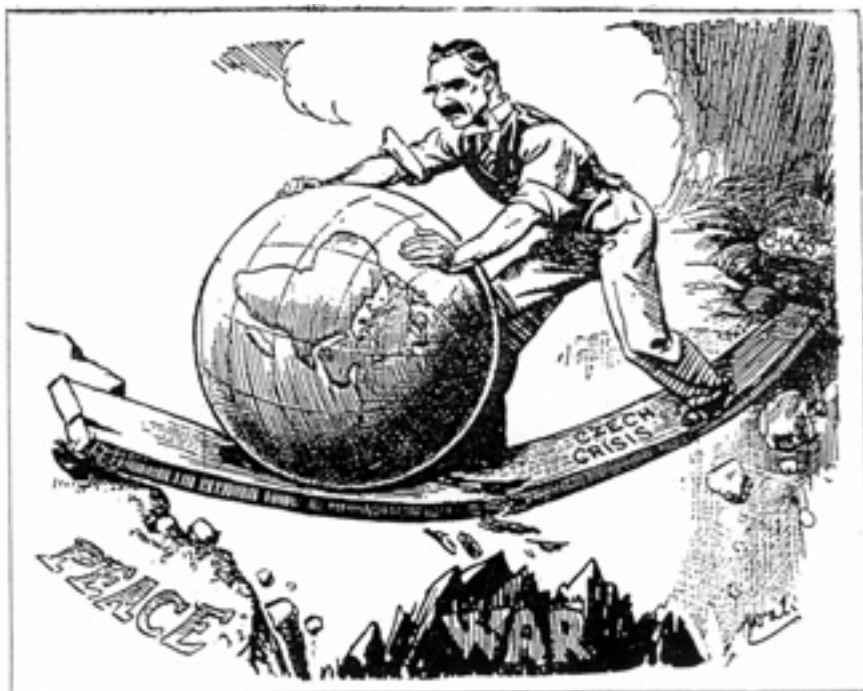
A cartoon published in a British newspaper on 25 September 1938.