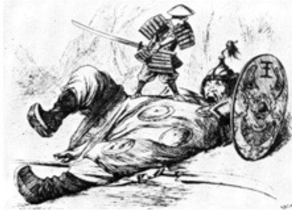
A cartoon published in a British magazine in 1895. It shows a Japanese soldier on top of a Chinese soldier.