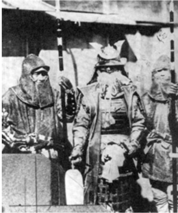
A photograph of Japanese warriors in 1868.