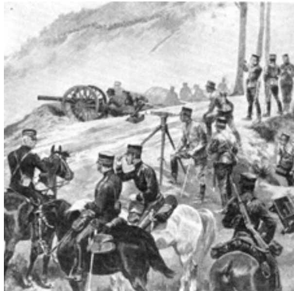
A drawing of Japanese soldiers in 1904.