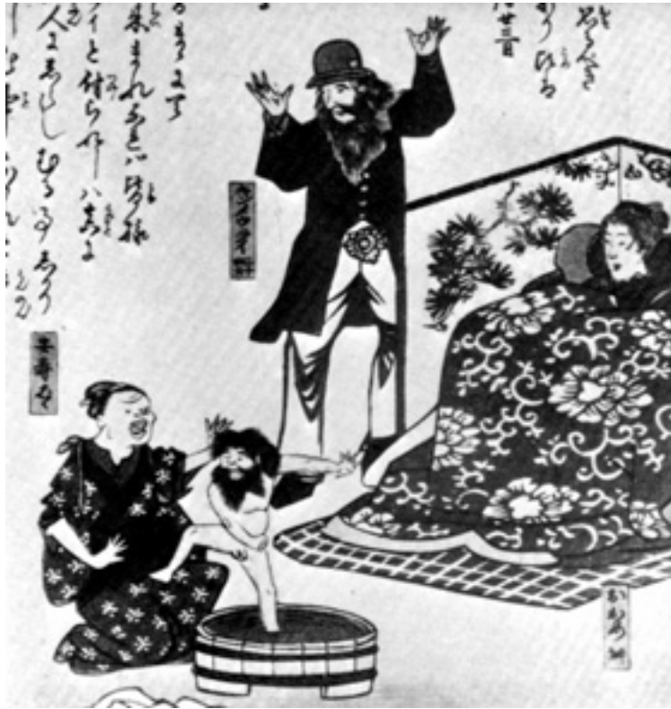
A Japanese drawing from the second half of the nineteenth century showing what would happen if Japanese women married Western men. The child is the result of the marriage.