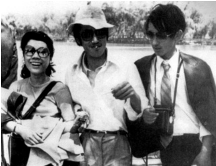
Photograph of young Chinese on the streets of Beijing in the 1980s.

16 Study the photograph and then answer the questions which follow.