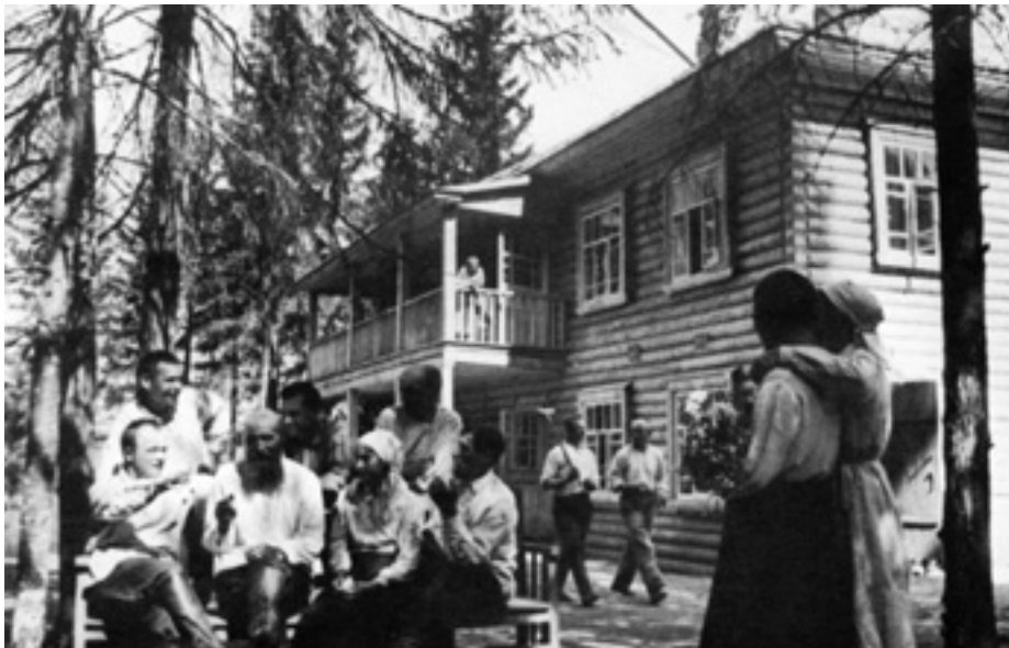
A hospital belonging to a collective farm.

12 Study the photograph and then answer the questions which follow.