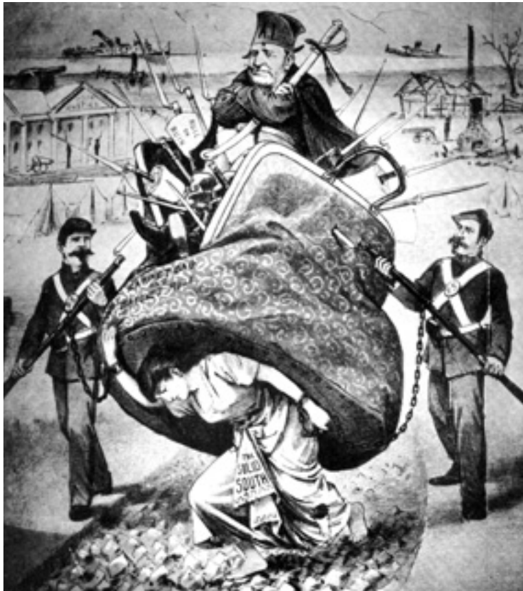
A cartoon of 1880 showing U.S. Grant and carpetbagging oppressing the South