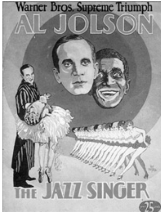
Poster for the film 'The Jazz Singer', the first 'talkie' film.

13 Study the picture and then answer the questions which follow.