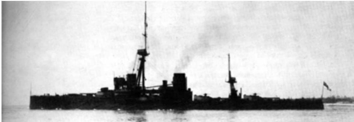
The British battleship HMS Dreadnought launched in 1906.

4 Study the picture and then answer the questions which follow.