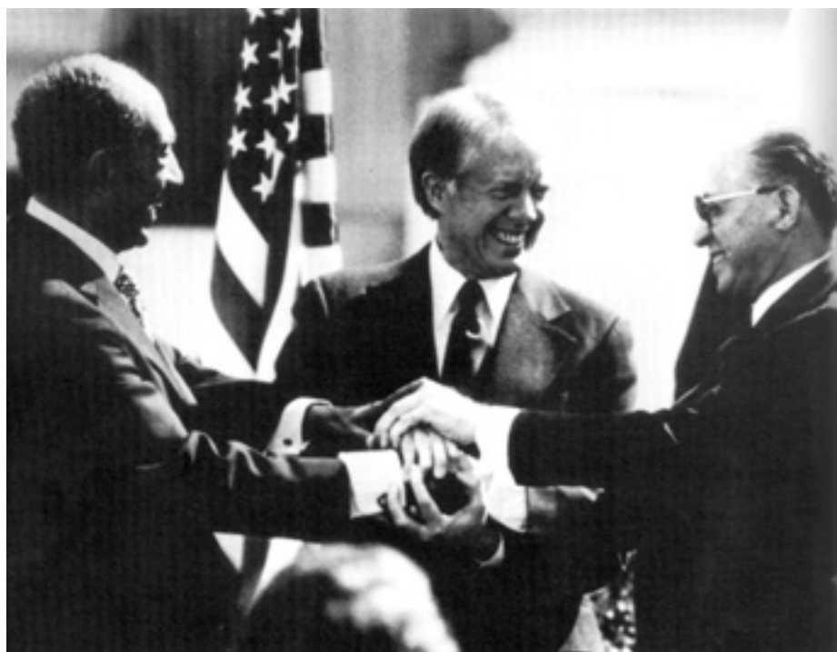
Begin, Sadat and US President Carter celebrate the peace treaty between Israel and Egypt, Washington DC, 16 March 1979.

21 Study the photograph and then answer the questions which follow.