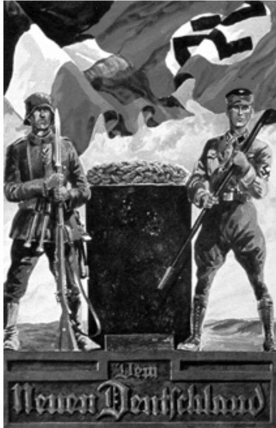
A Nazi poster of 1933 entitled 'New Germany' and showing a First World War soldier and a member of the SA.