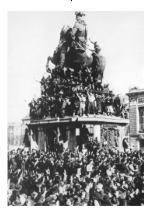
Enthusiastic Viennese demonstrate in favour of the Anschluss, 12 March 1938.

6 Study the photograph, and then answer the questions which follow.