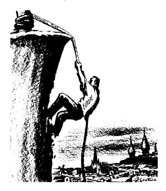
An American cartoon, showing the Marshall Plan giving help to Europe.

7 Study the cartoon, and then answer the questions which follow.