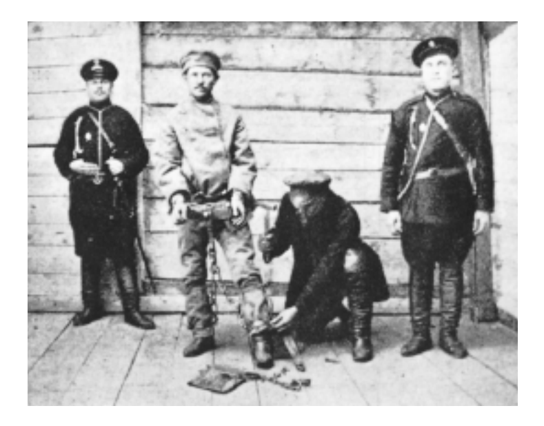
A prisoner of the Okhrana, the Tsarist secret police.

11 Study the photograph, and then answer the questions which follow.