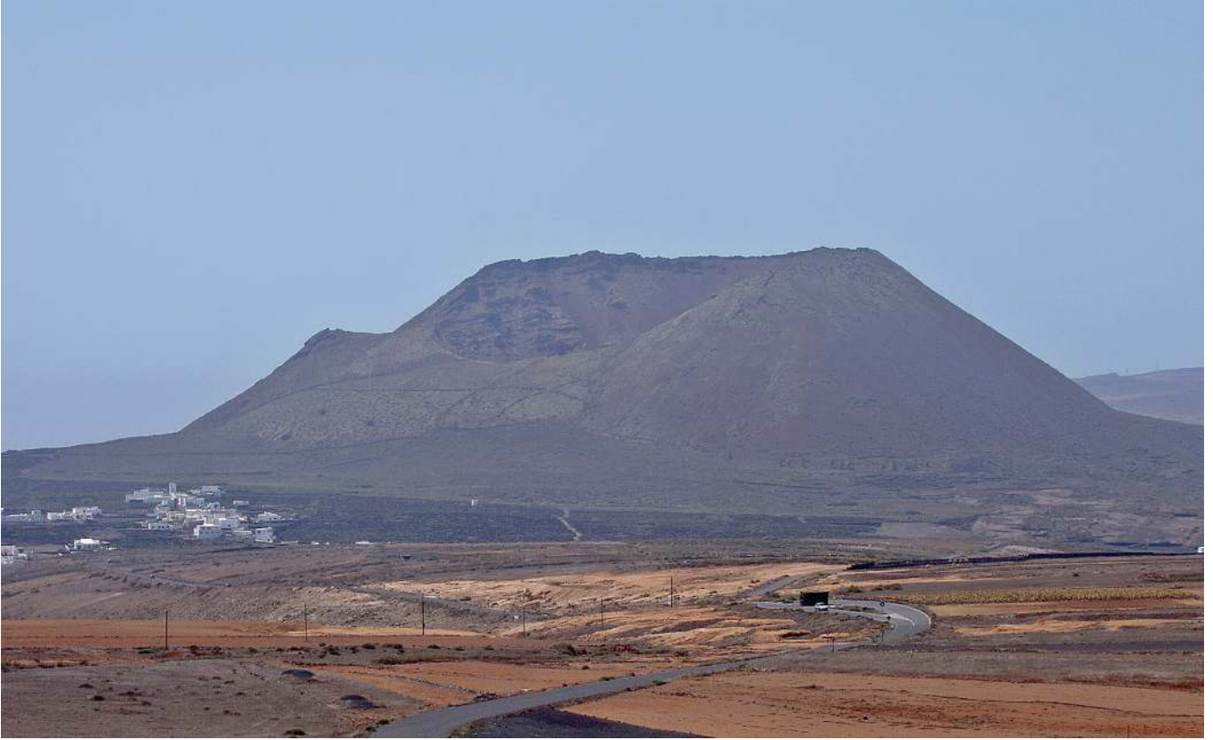
Fig. 2.1 for Question 2