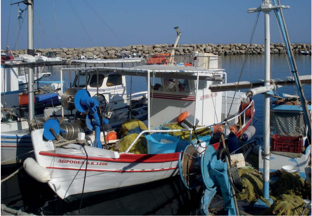
Fig. 3.2 for Question 3