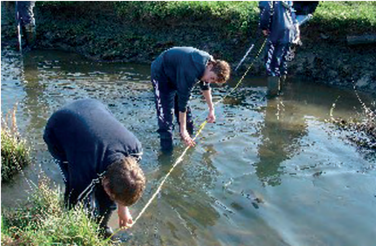
Photograph B for Question 1