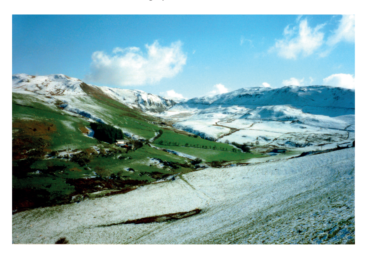
Photograph D for Question 2