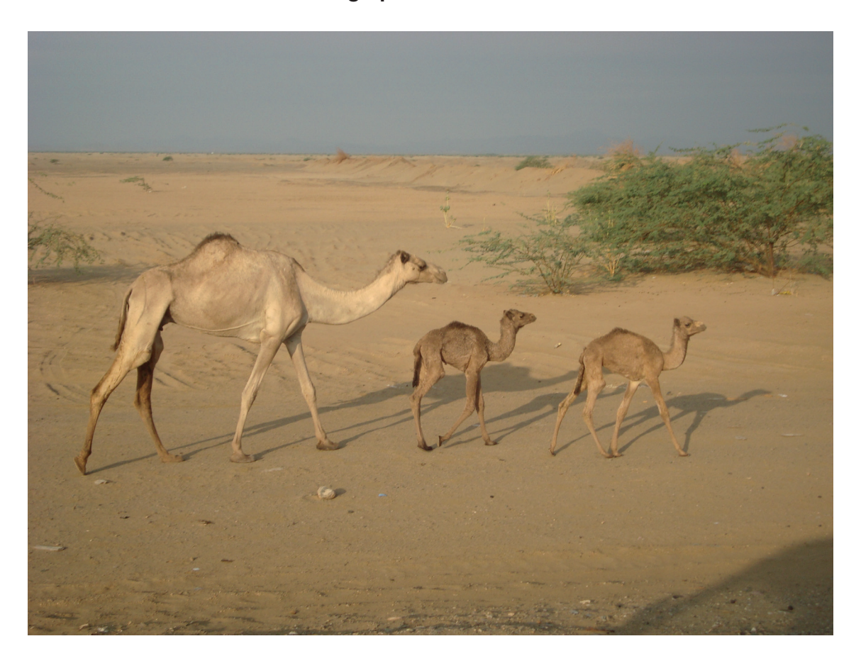
Photograph B for Question 1