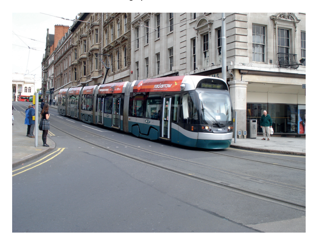
Photograph F for Question 3