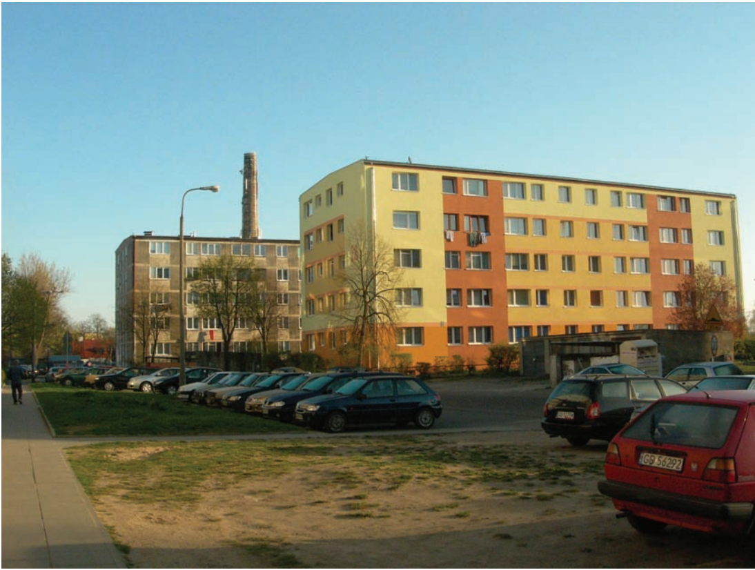
Photograph B showing area B for Question 2