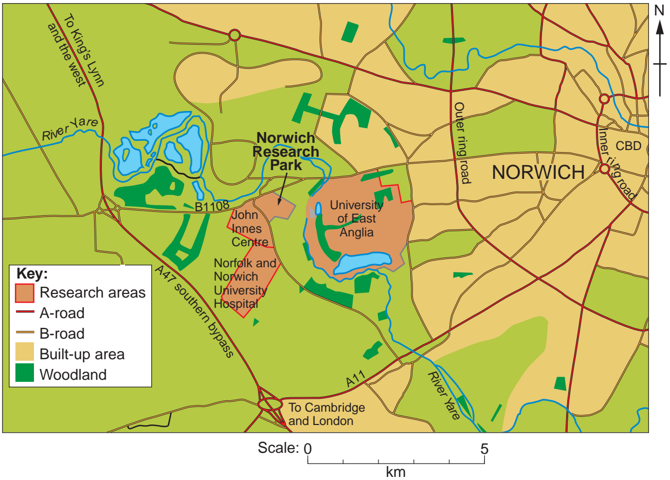
Fig. 8B for Question 5