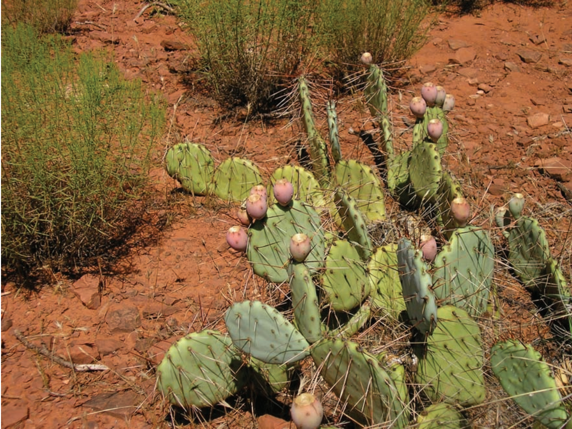
Photograph C for Question 6