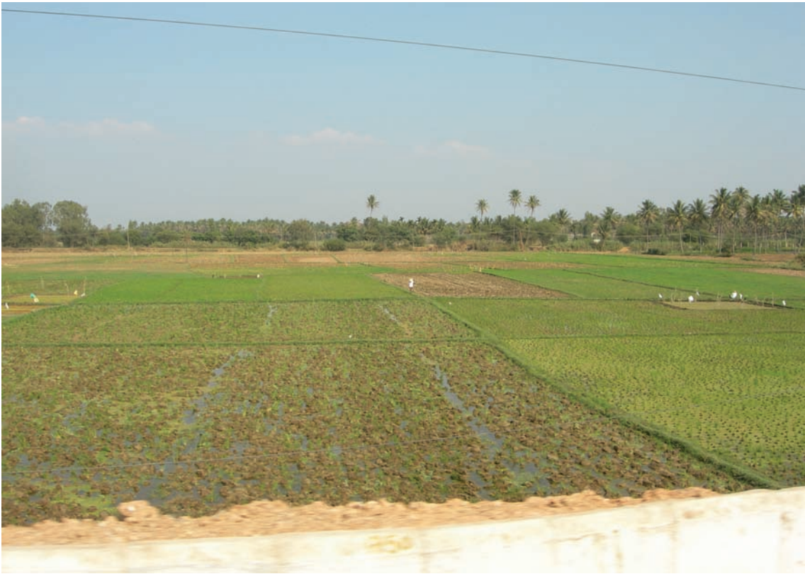
Photograph E for Question 6