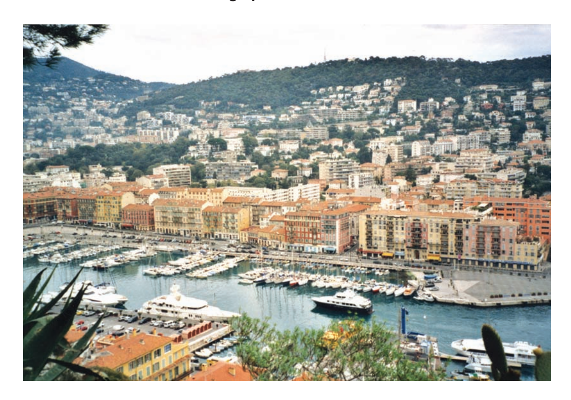
Photograph B for Question 2