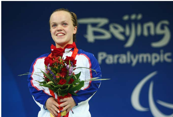
Eleanor Simmonds, Paralympic swimming gold medallist at 13!

The Guardian Friday 8 January 2010