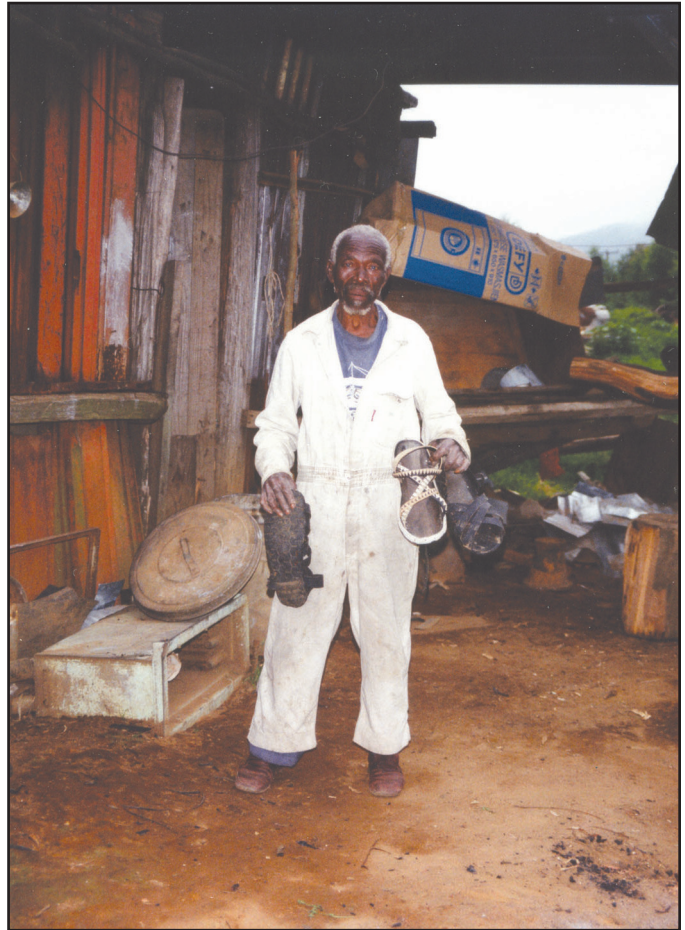
Fig. 4 A photograph which the student has taken.