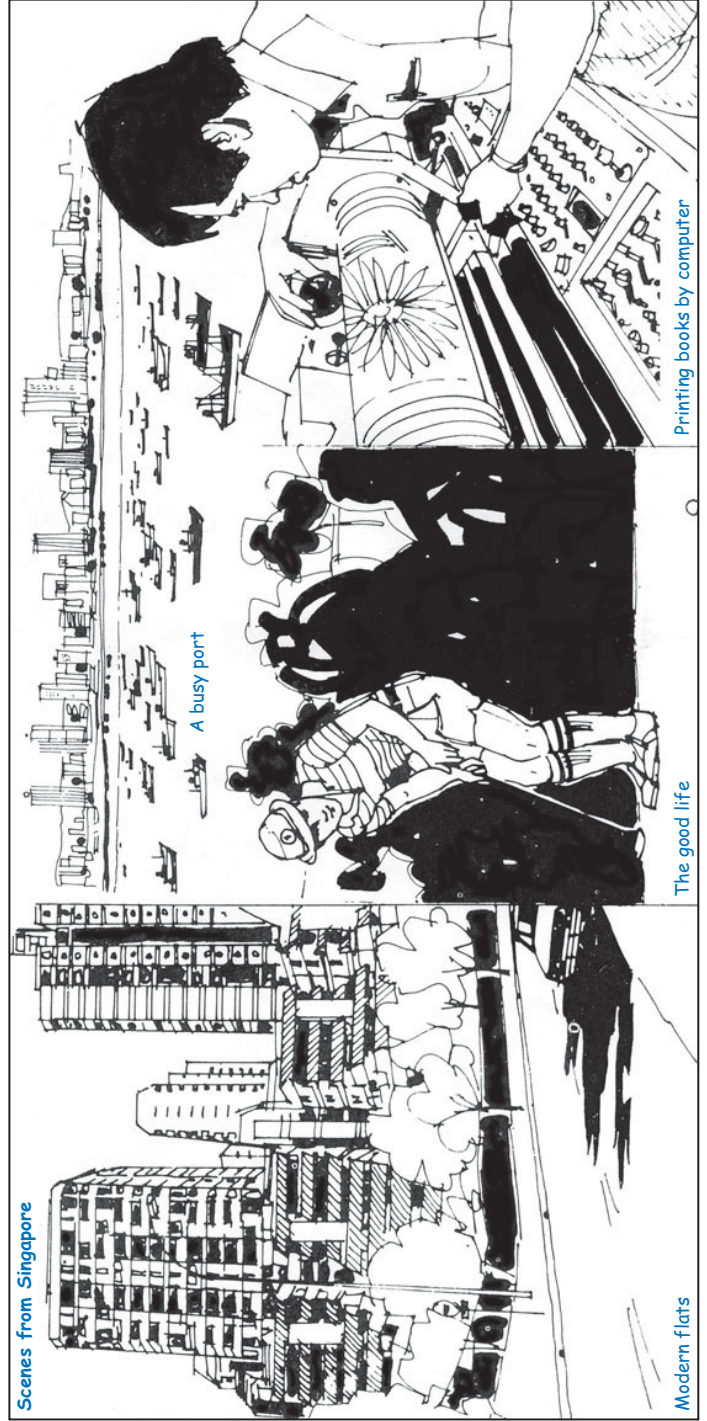
Scenes from Singapore

Most cannot afford to buy or rent a house. Even regular factory workers may find they cannot afford to do this.