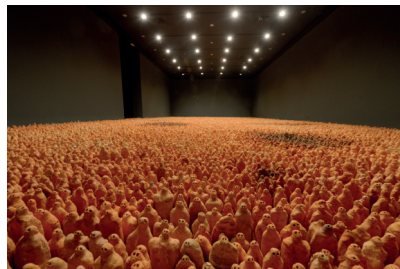
Antony Gormley Field Sculpture/Installation