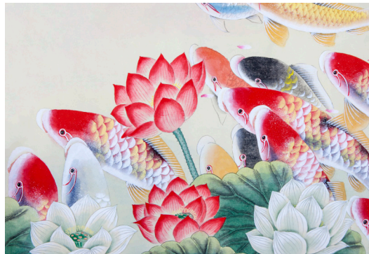
Traditional Chinese Painting Koi Carp Stock Illustration