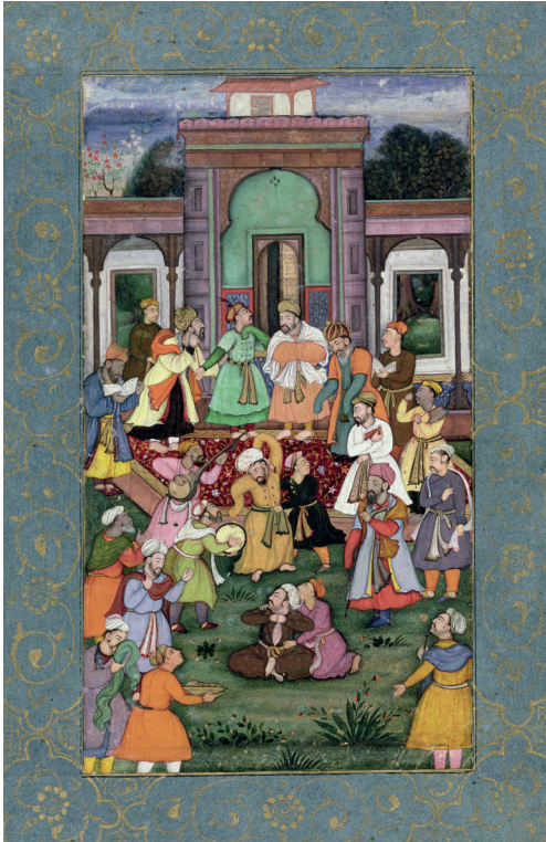
Mughal School, (16th century) Group of Whirling Dervishes, from the Large Clive Album, c.1595 (opaque w/c with gold on paper), Mughal School, (16th century) Poster