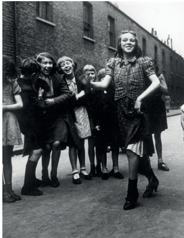
Bill Brandt East End Girl Dancing the Lambeth Walk Photograph

Bill Brandt