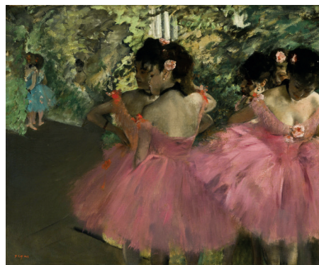
Edgar Degas Dancers in Pink Painting

2010 FIFA World Cup poster Dancers in Pink