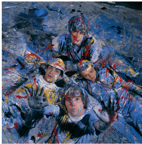
The Stone Roses

West Bengal Dance Group Federation observes International Dance Day at Mohor Kunja, Kolkata Photograph