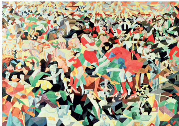
Gino Severini The Pan Pan at the Monico, 1959 (oil on canvas) Painting

Here are some other suggestions that may stimulate your ideas: