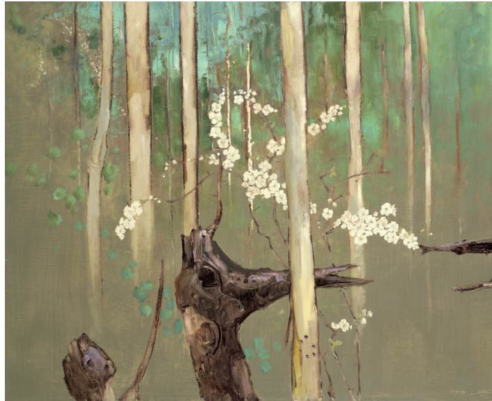
Clifton Ernest Pugh (1924-90) Sapling Forest, Cherry Plum Blossom, 1984 (oil on canvas) Painting