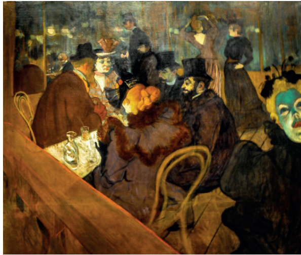
Henri de Toulouse-Lautrec At the Moulin Rouge Painting