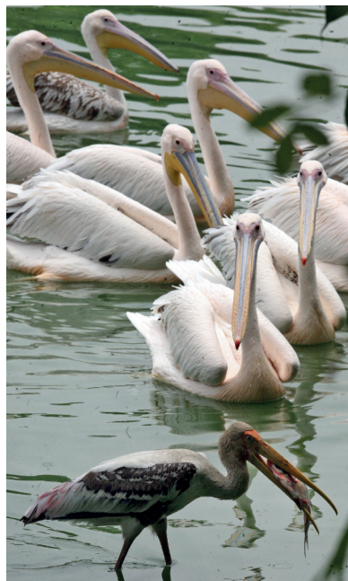
The Zoological Park in New Delhi, 28 July 2007 A painted stork (bottom) is watched by a group of Rosy Pelicans as it catches a fish in a pond Photograph

Traditional Chinese Painting, Koi Carp, Lotus The Zoological Park in New Delhi, 28 July 2007