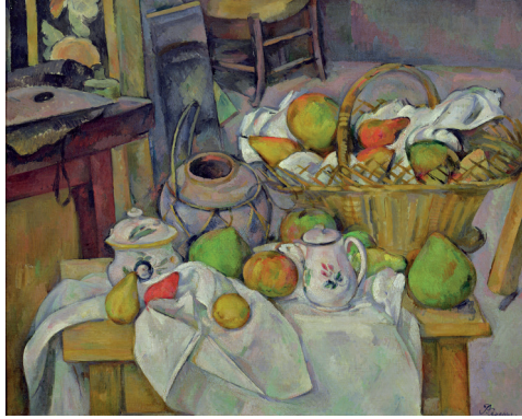
Paul Cézanne Kitchen table (Still-life with basket) Painting