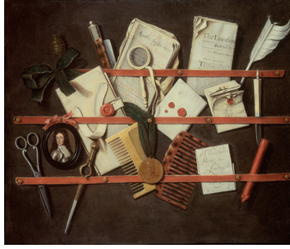
Colyer or Collier, Edwaert (c.1640-c.1707) Trompe l'oeil letter rack with a miniature portrait of a young man in armour, 1697 (panel) Painting