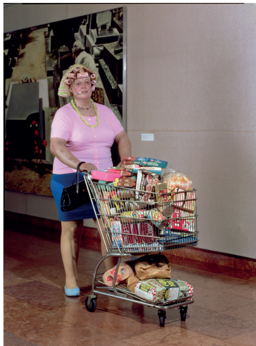
Duane Hanson Supermarket Shopper Sculpture

Here are some other suggestions that may stimulate your ideas: