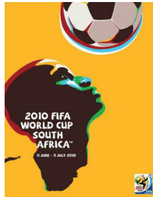
Paul Dale 2010 FIFA World Cup poster Poster