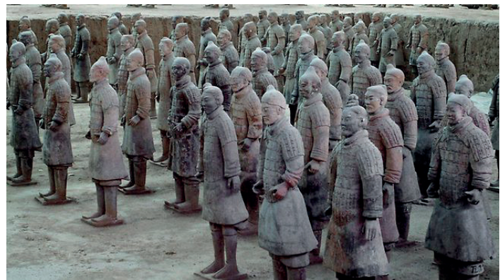
Qin Shi Huang (Qin emperor)