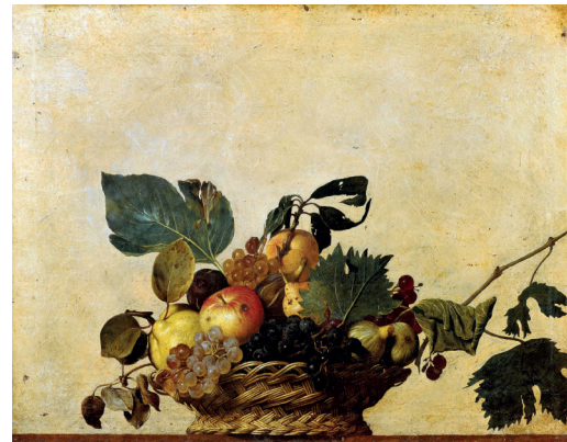
Michelangelo Merisi da Caravaggio