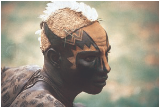
African body art

Three Women Playing Musical Instruments silk painting