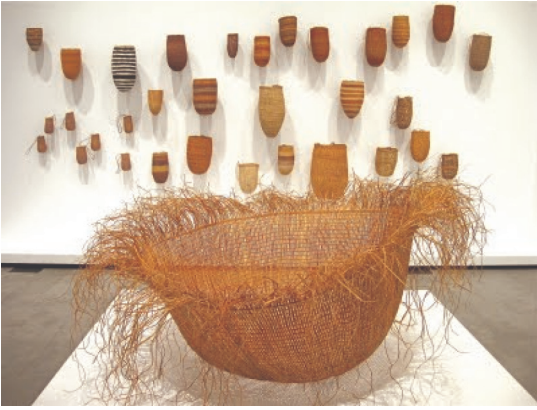
The Floating Life Exhibition Aboriginal fibre Art