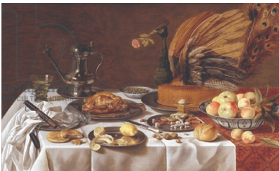
Pieter Claesz Still Life with a Peacock Pie painting