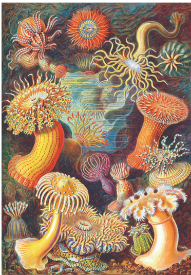
Ernst Haeckel Actiniae Sea Anemones illustration