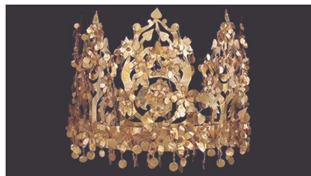
Tillya tepe gold crown (1st Century) metal work

The images on this page could help you think about possible ideas and could be used to support any starting point. You may prefer to explore and respond to other images.