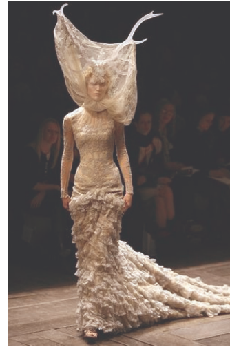
Alexander McQueen Fall 2006 ready-to-wear collection fashion design