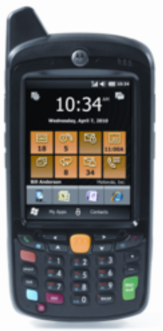
An example of a hand-held computer used by police officers

15 A police superintendent (senior police officer) commented: “Today the police officers just type in a registration number on their hand-held computer and within seconds they will have all of the information associated with that car and its owner.”