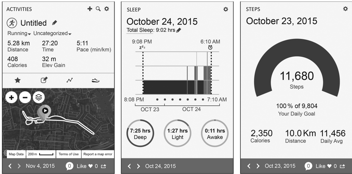
Figure 2 – Example of data from the “Garmin Connect” service