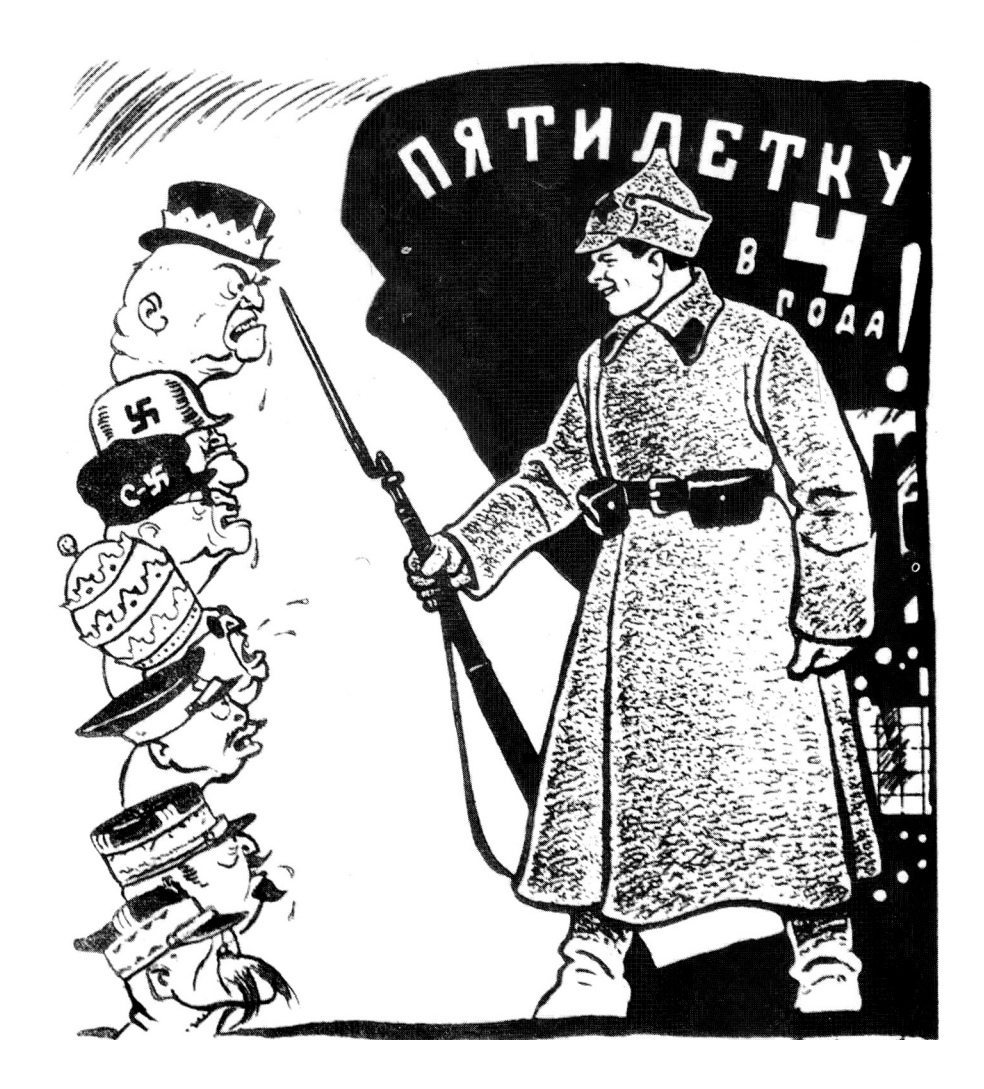
'Seven Problems – one answer! (The Five-Year Plan in Four Years).' The seven heads on the left of the poster represent capitalist enemies.