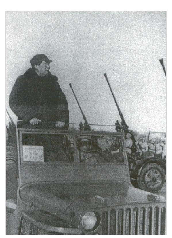
On 21 January 1949, Chiang Kai-shek (Jiang Jieshi) resigned as President of the Republic of China, and later escaped to Taiwan. In March Mao arrived in Beijing. The Guomindang had about 200 000 troops in and around the city, but the general commanding this force had surrendered his men, and their weapons, without a serious fight.

A contemporary photograph of Mao Zedong (Mao Tse-tung) entering Beijing March 1949 (reproduced in Modern China by Edwin E Moise, London, 1977).