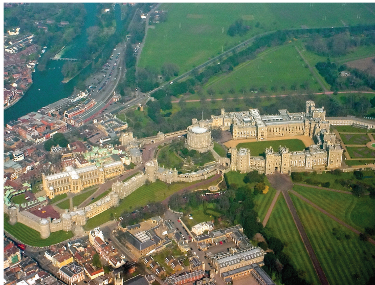
Figure 1: Windsor Castle