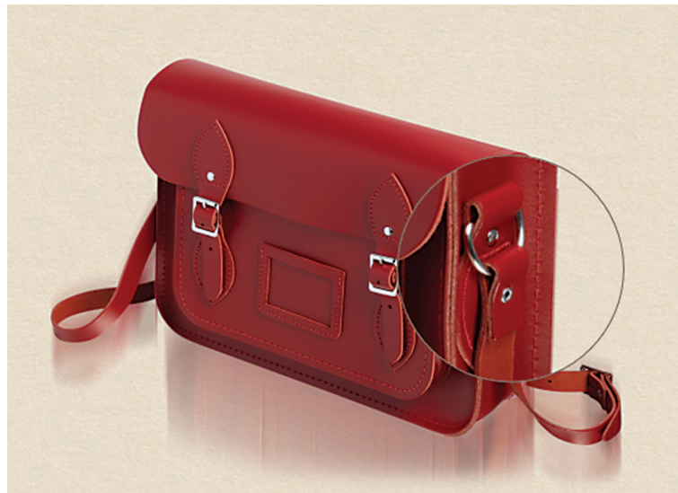
Figure 5: Detail showing the strap joined to the bag