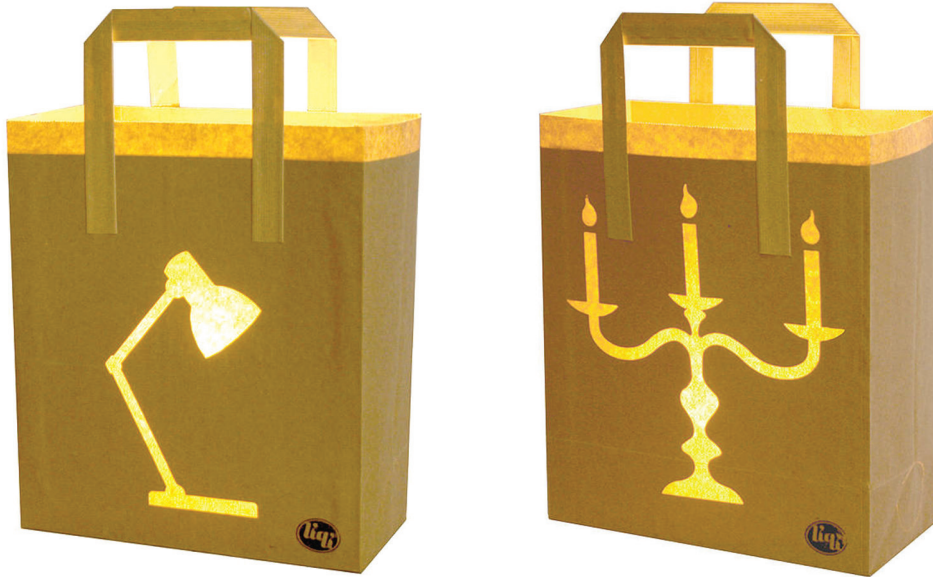
Figure 7: Bagalight table lamp