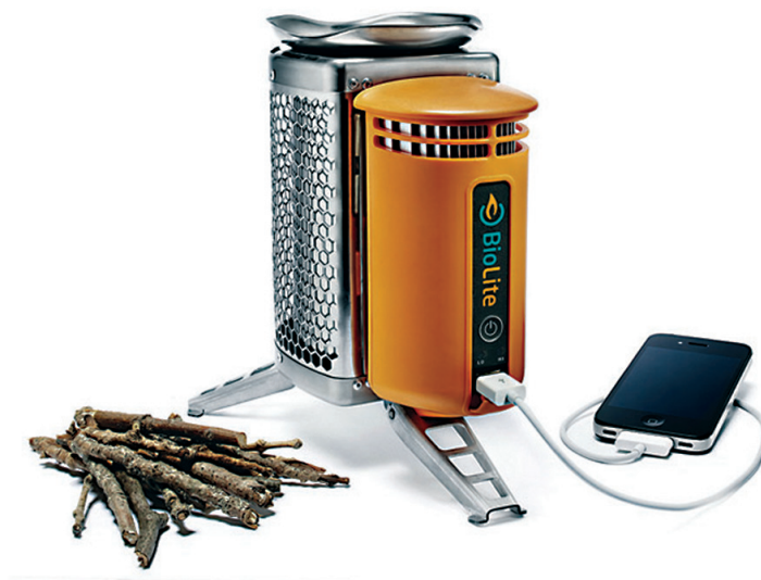
Figure 6: Biolite stove