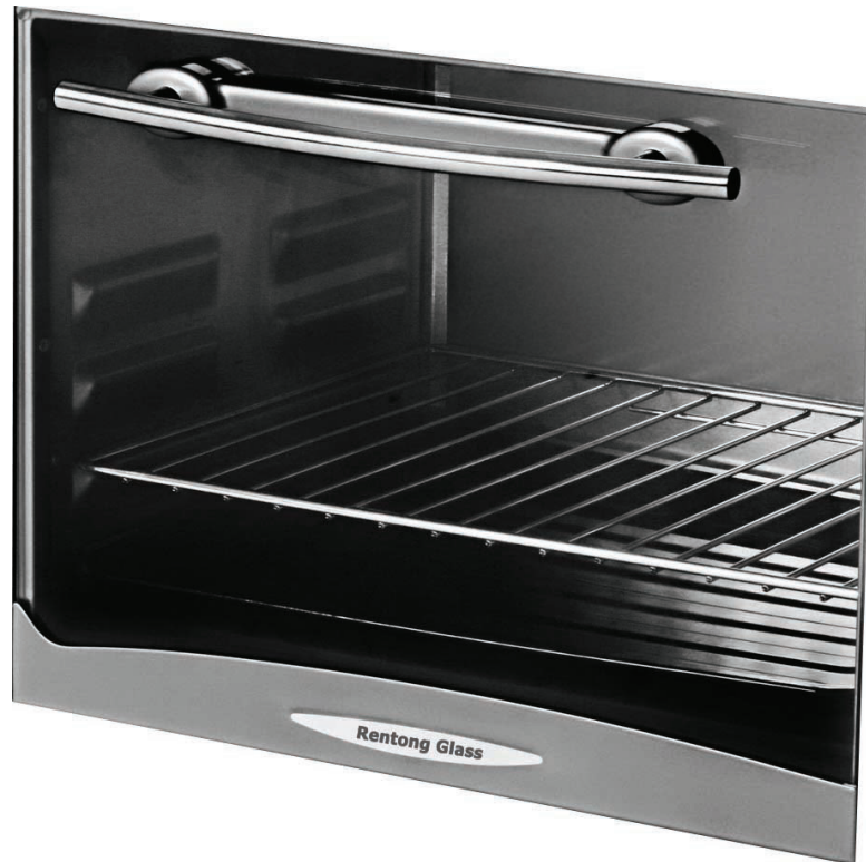
Figure 2: An oven door made from glass and metal