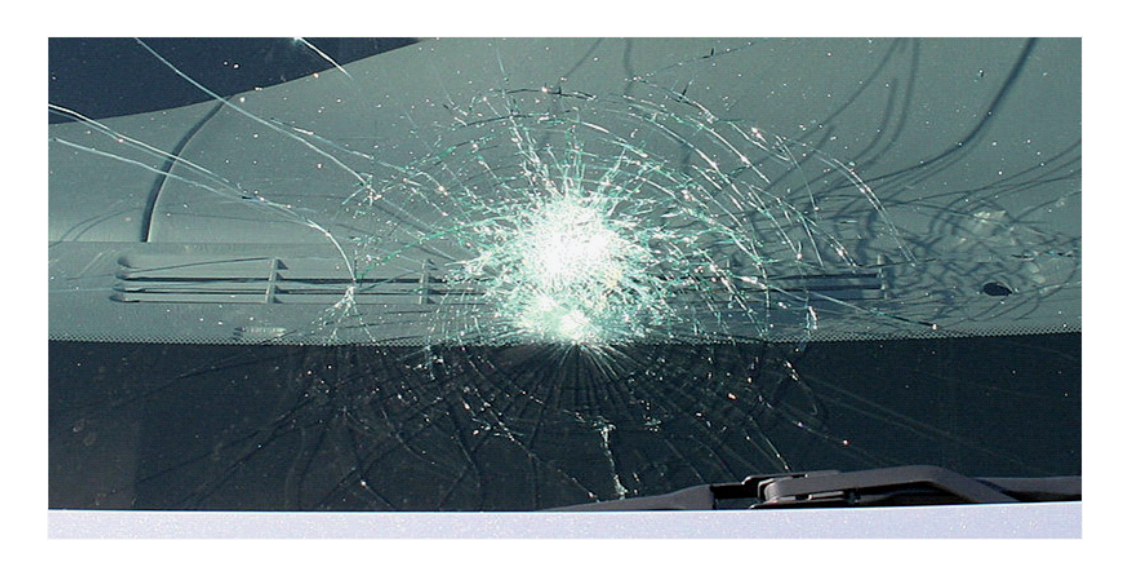
Figure 6: A car windscreen damaged by impact