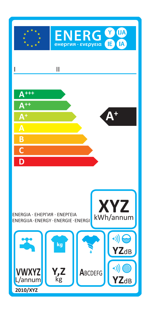
Figure 2: EU energy label for a washing machine

11. Figure 2 shows the design of the European Union (EU) energy label for washing machines which is used in all 27 EU member states.