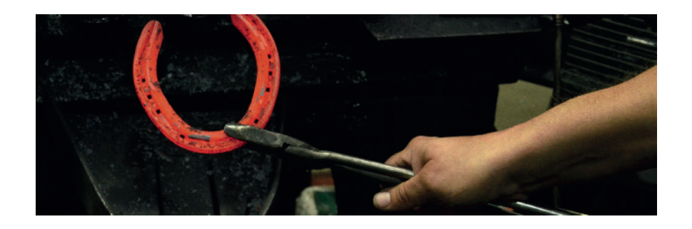
Figure 5: Manufacturing a horseshoe