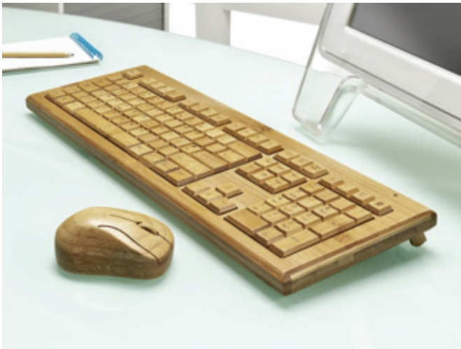
Figure 4: Wooden keyboard and mouse