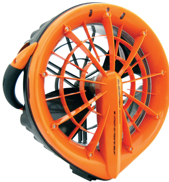
Figures 7a and 7b: Bladefish diving aid