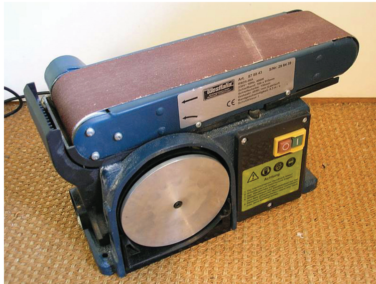
Figure 3: Electric belt sander