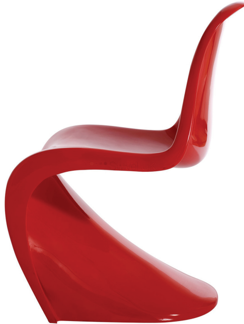
Figure 6: Panton S-shaped chair