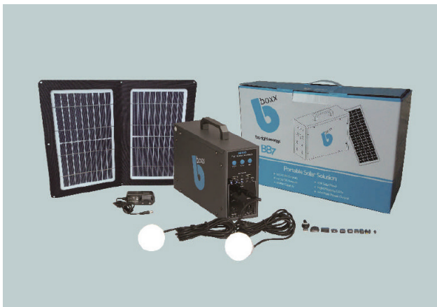
Figure 1: BBOXX plug & play solar system