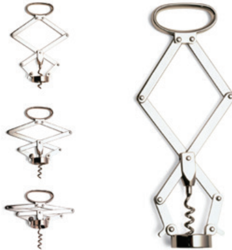
Figure 8: The Socrates corkscrew

[Source: JM06 – Socrates Corkscrew in 18/10 stainless steel mirror polished by Jasper Morrison for Alessi. Used with the permission of Alessi S.p.A., Crusinallo, Italy]