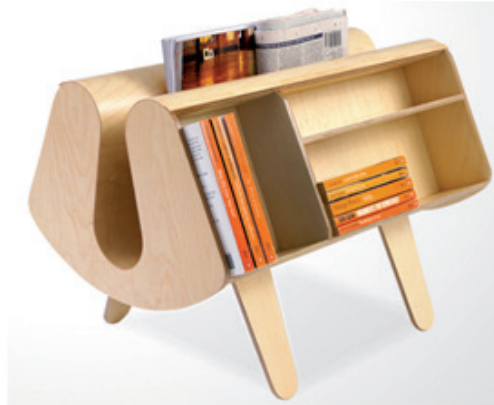
Figure 7: The Isokon Penguin Donkey Magazine/book rack