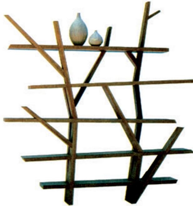
Figure 2: “The Legend” shelf unit