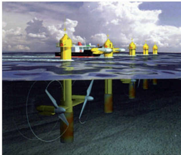
Figure 1: CAD image of a tidal power scheme