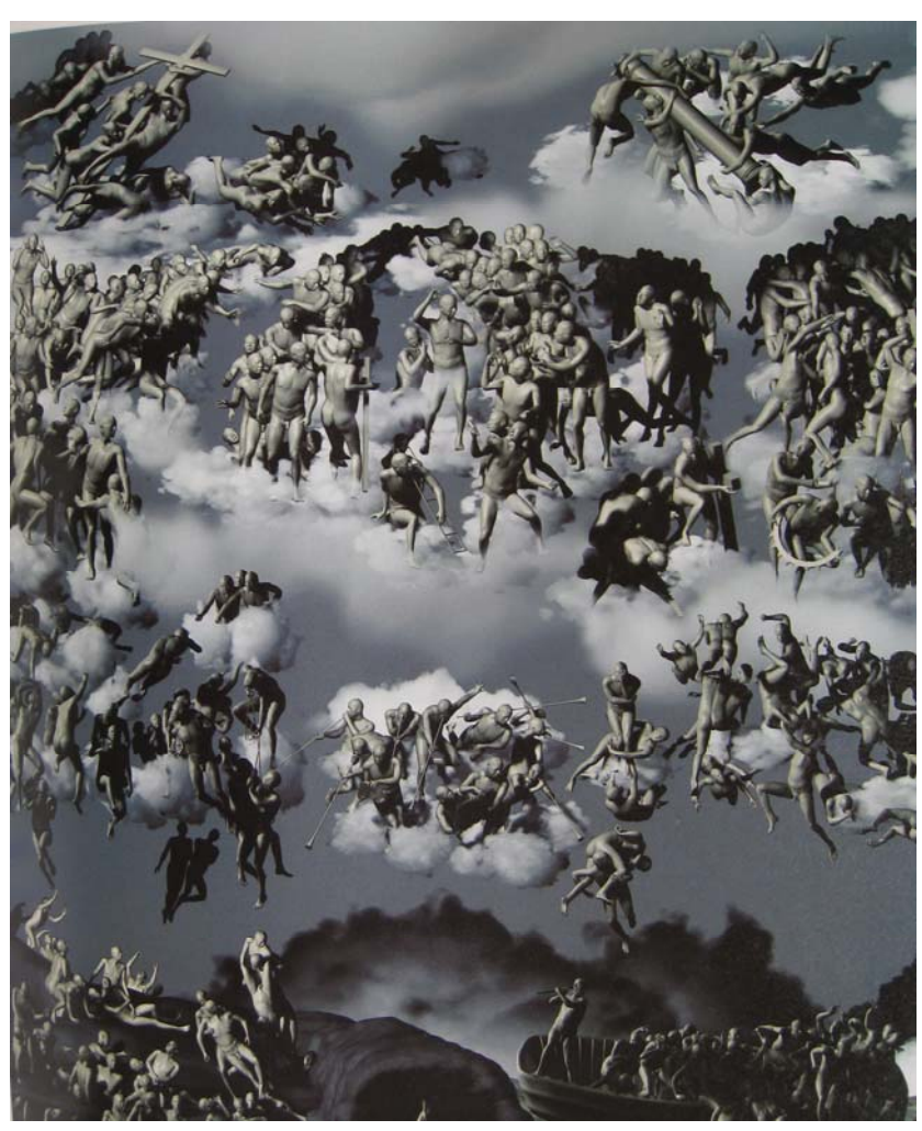
Plate (8) Miao Xiao Chun. The Last Judgement in Cyberspace-The Front View. 2006. Digital output photo paper. 197 x 190 cm.