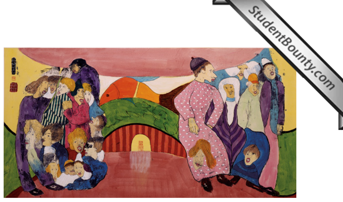
Plate (7) Luis Chan. The Green Bridge. 1980. Acrylic on Canvas. 69 x 135 cm.