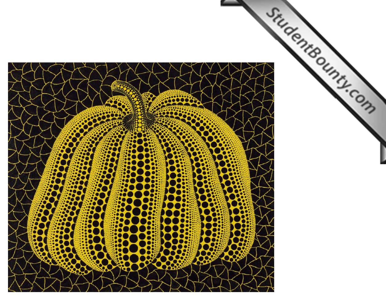
Plate (9) Yayoi Kusama. Pumpkin. 1998. Acrylic on Canvas. 45.9 x 53.2 cm.