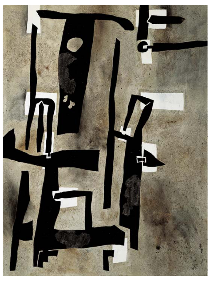
Plate (4) WANG Huai Qing. Separation and Reunion. 1992. Oil on canvas. 145 x 112 cm.