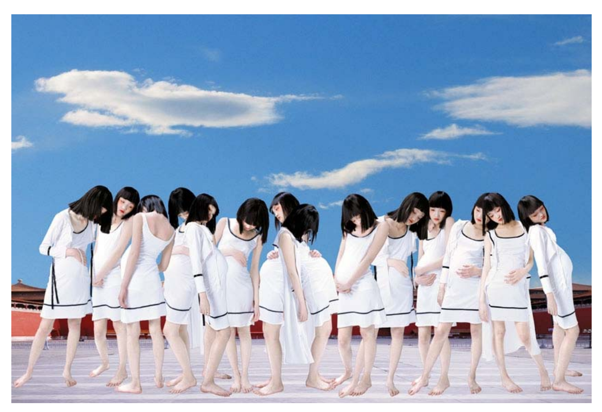
Plate (6) Cui Xiu Wen. Angel No.5. 2006. Photography. 100 x 150 cm.