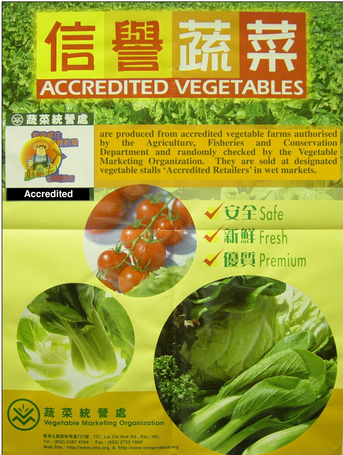
Source: Vegetable Marketing Organization Poster