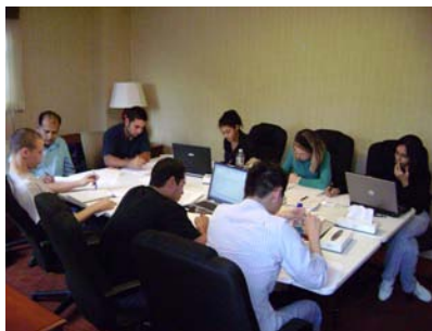
TURBOPREP® CLASS IN NYC