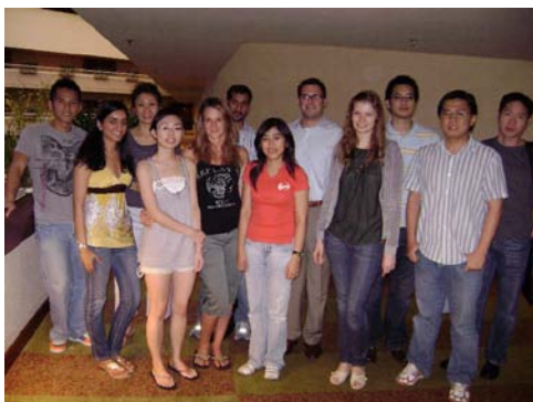
GMAT TURBOPREP CLASS IN SINGAPORE

Be informed and be smart -- Choose MLIC GMAT prep courses that offer full-time MBA instructors who proactively coaches you in GMAT-critical areas, and backs up its training with industry-leading GMAT Score Guarantee™ MLIC trains more people per month in the major markets than any other company. Kaplan, Princeton Review, Manhattan GMAT, Veritas Prep, Testmasters, and others.