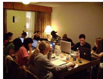
GMAT TURBOPREP CLASS IN DALLAS

(Read more about why Other courses are not a patch on MLI GMAT prep on pages 8 to 13 in this brochure)