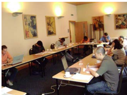
TURBOPREP® CLASS IN LONDON

You can also register by calling us at +1 212 682 5000 / +44 (0) 208 123 5060, or toll-free at 1 888 565 GMAT (USA/ CANADA only)