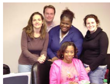
GMAT TURBOPREP GROUP ATLANTA