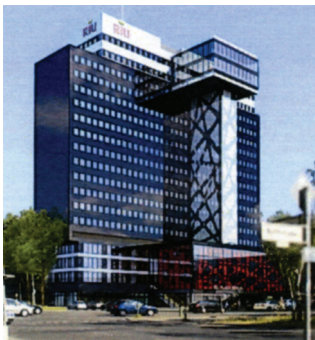
Hotel Riu Plaza