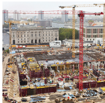
U-Bahn station construction