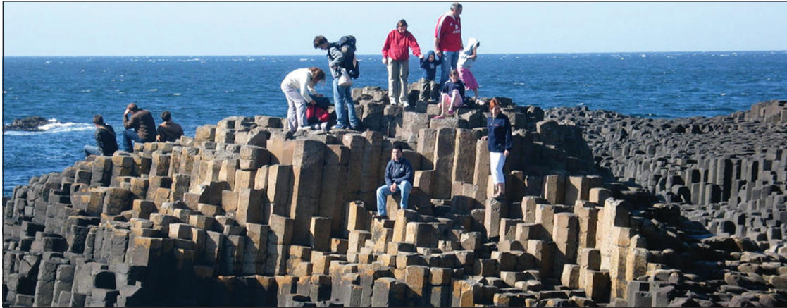
The Giant's Causeway

The Giant's Causeway is an area of about 40,000 interlocking basalt columns the result of ancient volcanic activity. The tops of the columns form stepping stones that lead from the cliff foot and disappear under the sea. It is located in County Antrim on the north east coast of Northern Ireland.