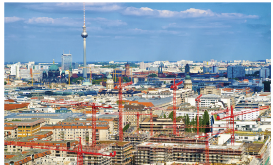
Cranes on Berlin's skyline