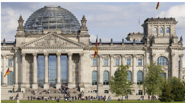
Bundestag - the renovated parliament building