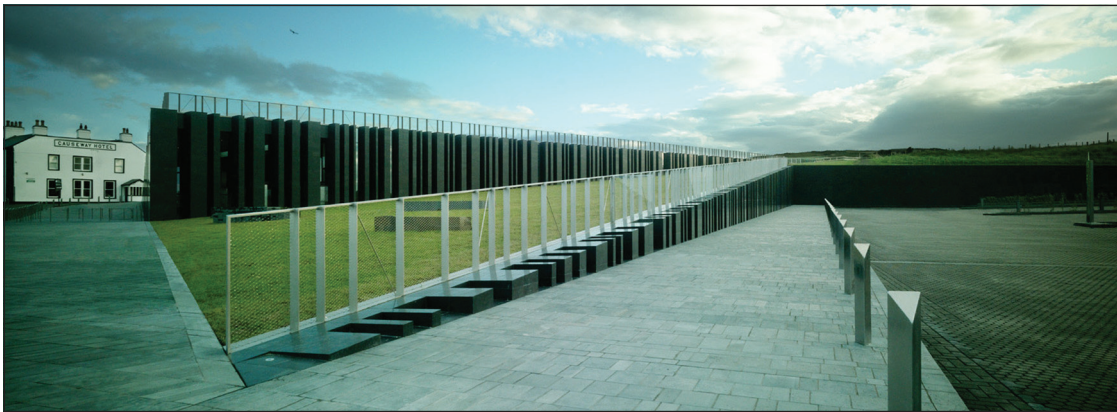
The Giant's Causeway Visitor Centre

The Giant's Causeway was declared a World Heritage Site by UNESCO in 1986, and a National Nature Reserve in 1987 by the Department of the Environment for Northern Ireland. Today it is owned and managed by the National Trust and is the most popular tourist attraction in Northern Ireland.