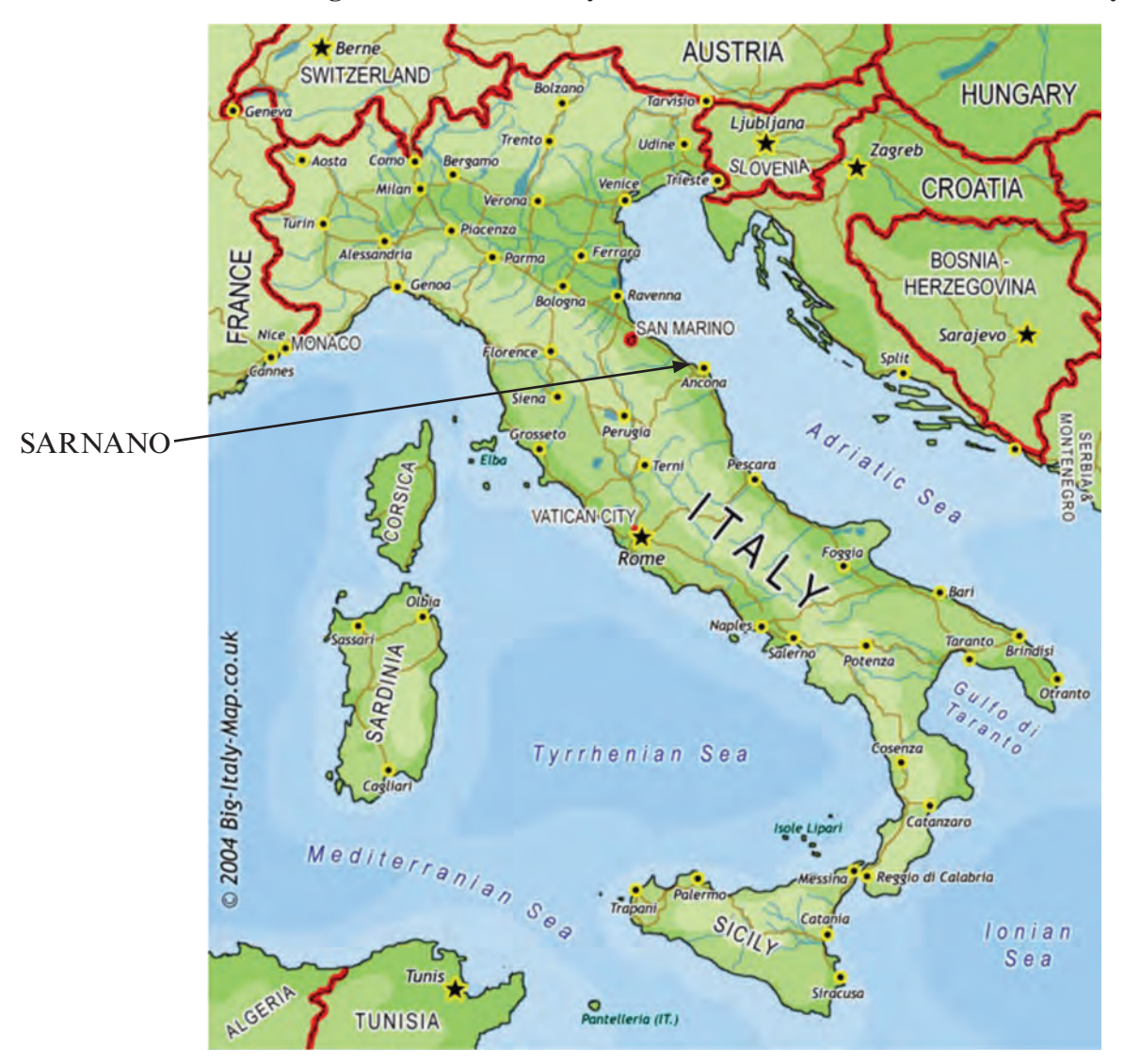
The Marche region surrounds the city of Ancona located on the east coast of Italy.

Villa San Raffaello is located 2 kms from the medieval town of Sarnano and the Sibillini National Park. The region is known as Le Marche and is a tapestry of ancient cities, rolling hills, awesome mountains, hidden valleys and the Adriatic Coast with its long, sandy beaches within an hour's drive. In short, an outstanding Italian holiday destination.