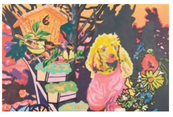
Contemporary art from all over the world