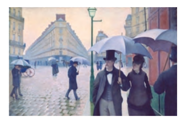
The Impressionists at the Essen Museum

Thousands of art and culture events are planned for the coming year and over five million visitors are expected from all over the world but especially Europe.