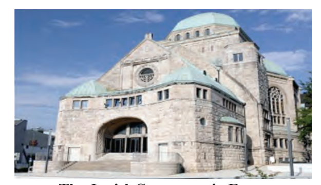
The Jewish Synagogue in Essen

The title of Cultural Capital 2010 was a windfall for the Ruhr, a former industrial powerhouse in western Germany that has been struggling with severe unemployment and poverty since the collapse of the coal-mining industry.