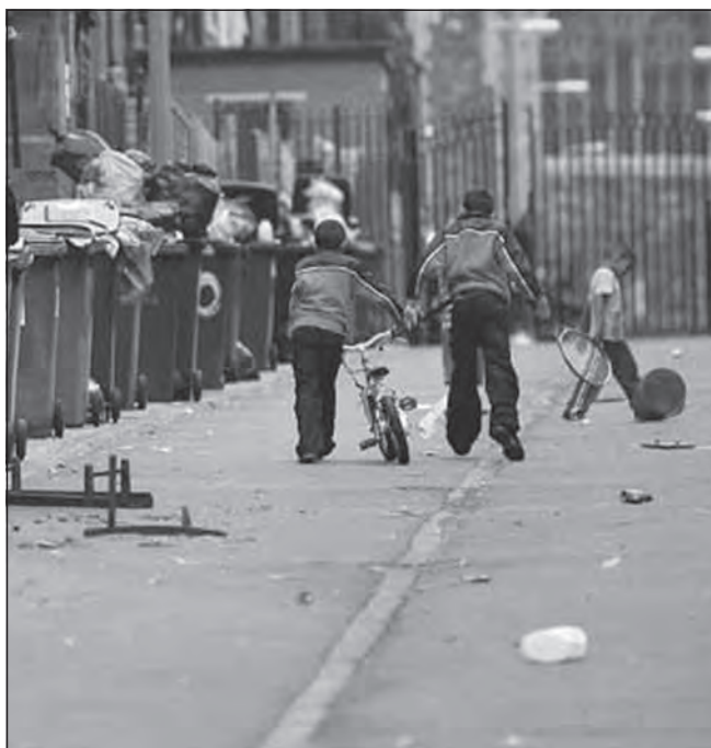
Wales poverty hotspots

Research has shown that there is a link between deprivation and poor health.