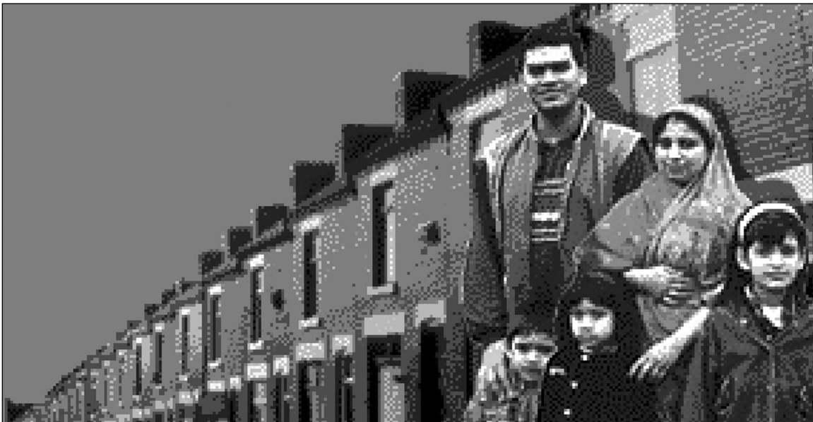
Different generations living together “enrich society”

The “traditional nuclear family” is often seen by MPs as the ideal family unit for a stable society. They compare the gay dads, spiralling divorce rates and working mothers of today, with a golden past where a wife, husband and their two or three children lived happily under one roof.