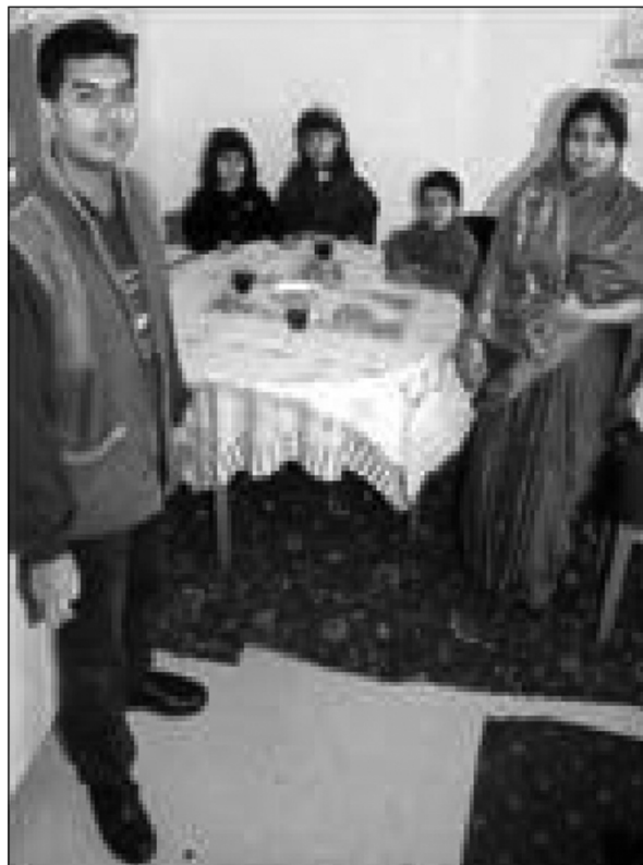
"The picture is starting to look like Britain in the 1950s"