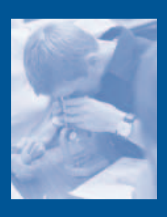
For more information visit the AQA Website at www.aqa.org.uk and click on the New GCSE Science Curriculum link