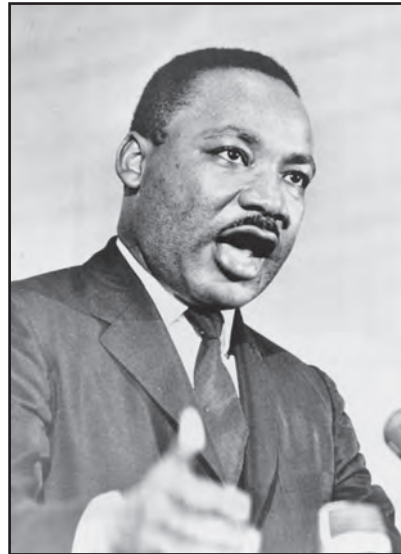
Martin Luther King