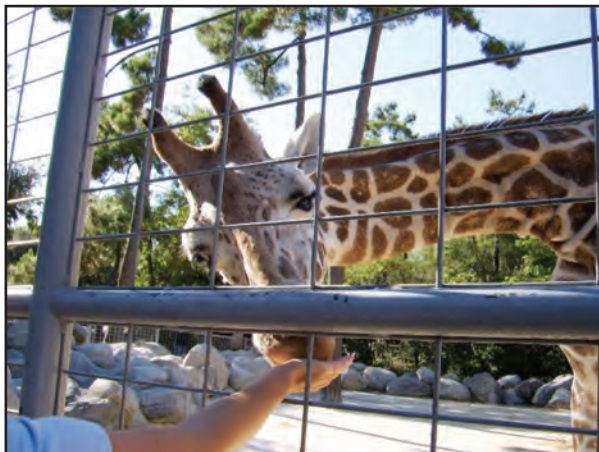
Caring for the World