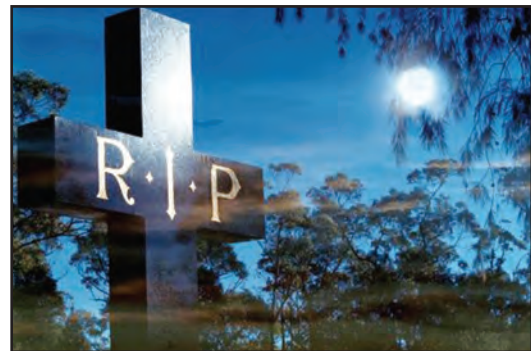
Rest in Peace