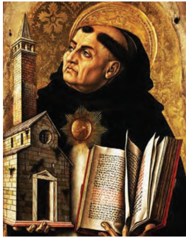
St Thomas Aquinas developed the Just War Theory

1. Study the pictures and words below and answer the questions that follow.