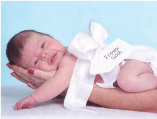
A CHILD BORN WITH THE HELP OF IVF

In Vitro Fertilisation is when a woman's egg is fertilised outside the womb and then placed in the womb.