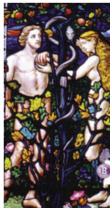
An image of Adam and Eve