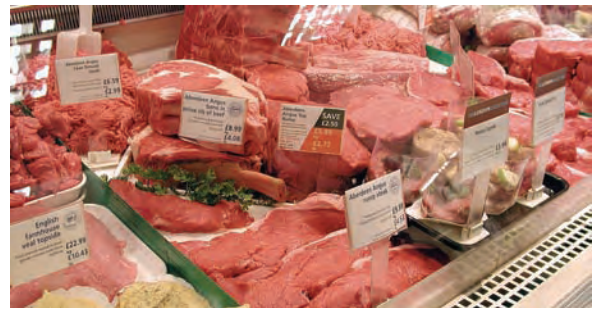
Meat for sale at a butcher's shop