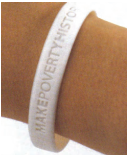
Make poverty history