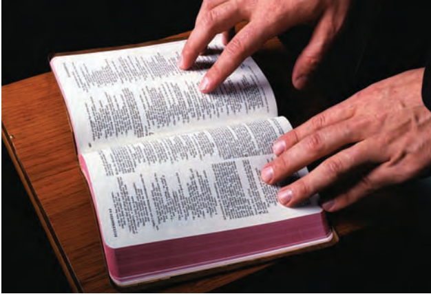
A Christian at Worship

3. Study the words and pictures below and answer the questions that follow.