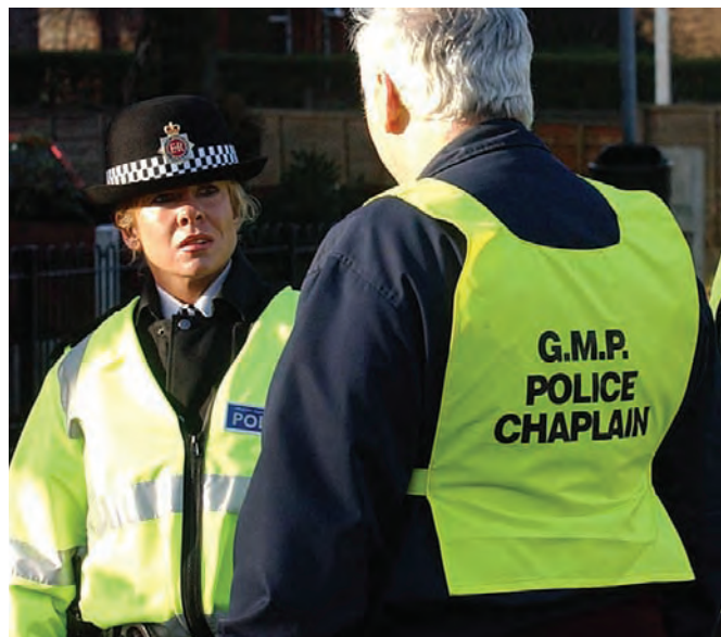
Female Police Officer speaking to Police Chaplain