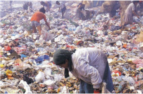
Poor people at work on a rubbish tip