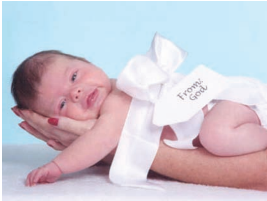
A CHILD BORN WITH THE HELP OF IVF

In Vitro Fertilisation is when a woman's egg is fertilised outside the womb and then placed in the womb.