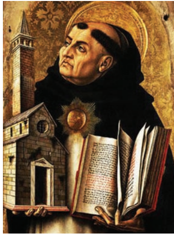
St Thomas Aquinas developed the Just War Theory

1. Study the pictures and words below and answer the questions that follow.