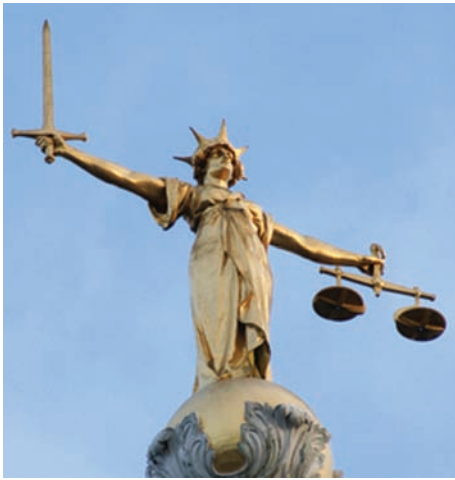
Scales of justice are often on top of law courts

4. Study the pictures and words below and answer the questions that follow.