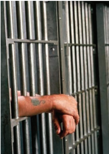
A prisoner serving a life sentence