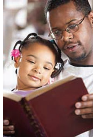
The Bible is a source of authority for many Christians