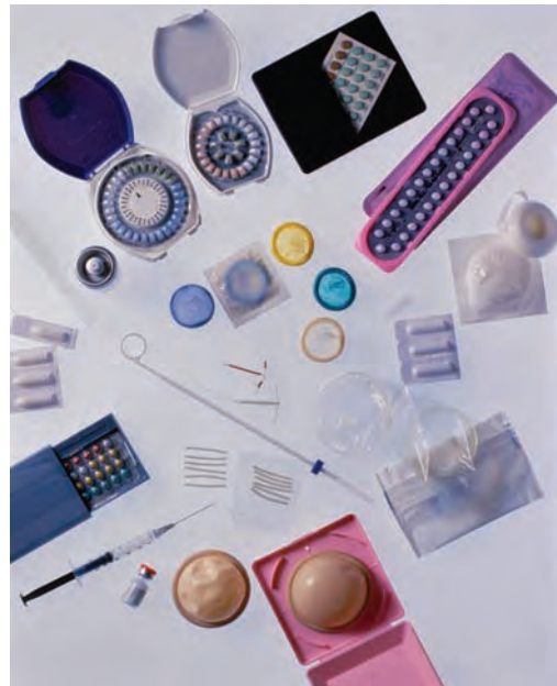
Methods of contraception