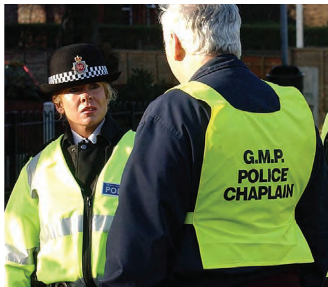
Female Police Officer speaking to Police Chaplain