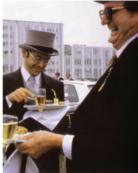
Two rich men enjoying themselves