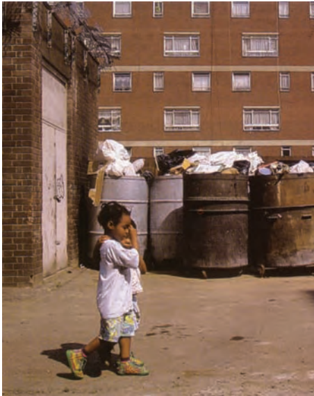
Children being brought up in poverty

2. Study the words and pictures below and answer the questions that follow.