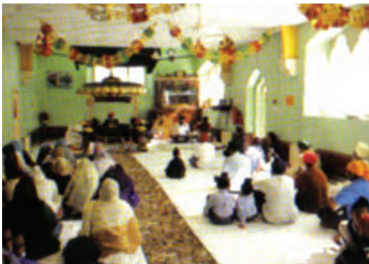
Sikhs at Worship