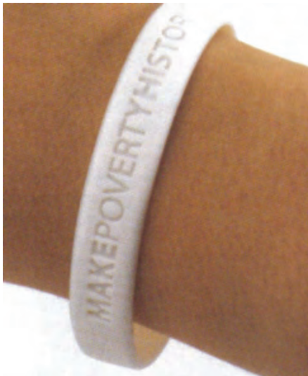
Make poverty history