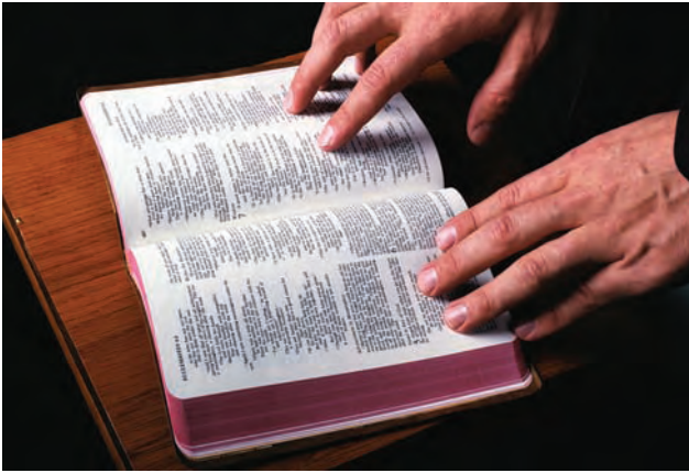
A Christian at Worship

3. Study the words and pictures below and answer the questions that follow.