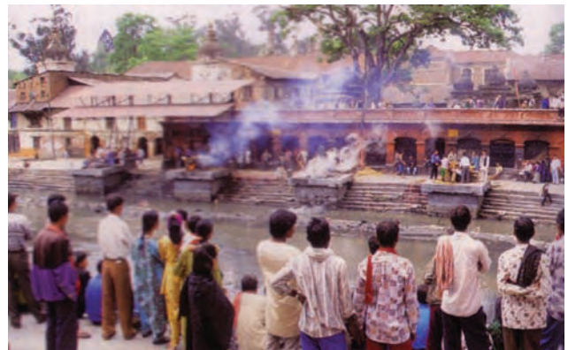
A Hindu Cremation