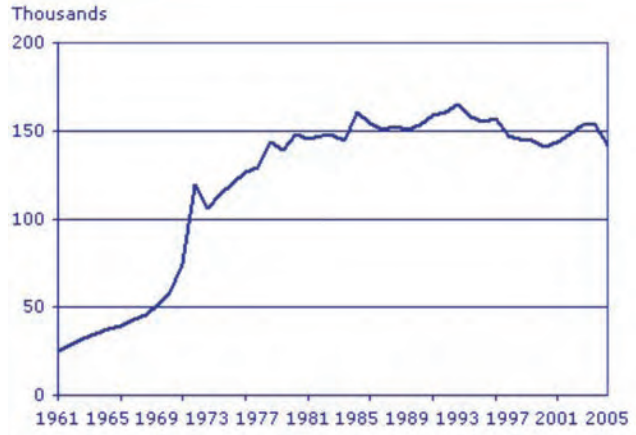
The divorce rate in the United Kingdom