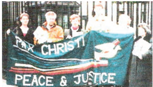
Should religious believers take part in war?