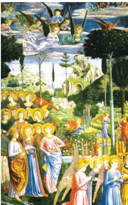
A picture of angels in heaven by the artist Benozzo di Gozzoli.