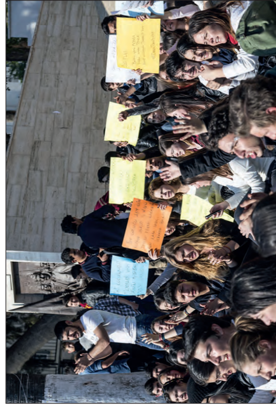
A group of people sat on the floor holding protest posters