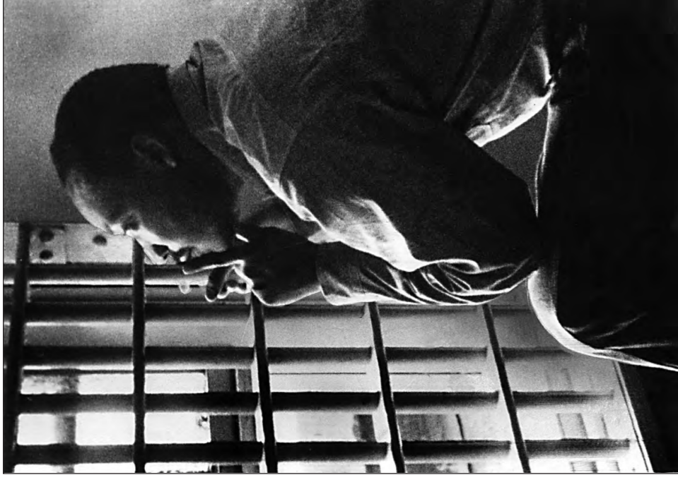
Martin Luther King looking out of a prison cell