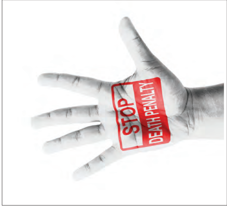
A hand held up saying 'STOP. Death Penalty'