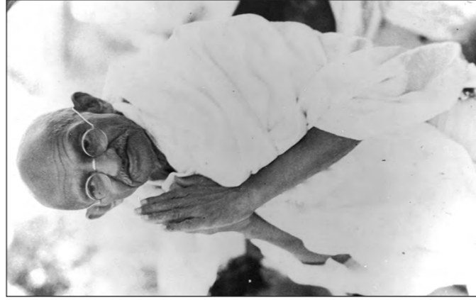
Picture of Gandhi