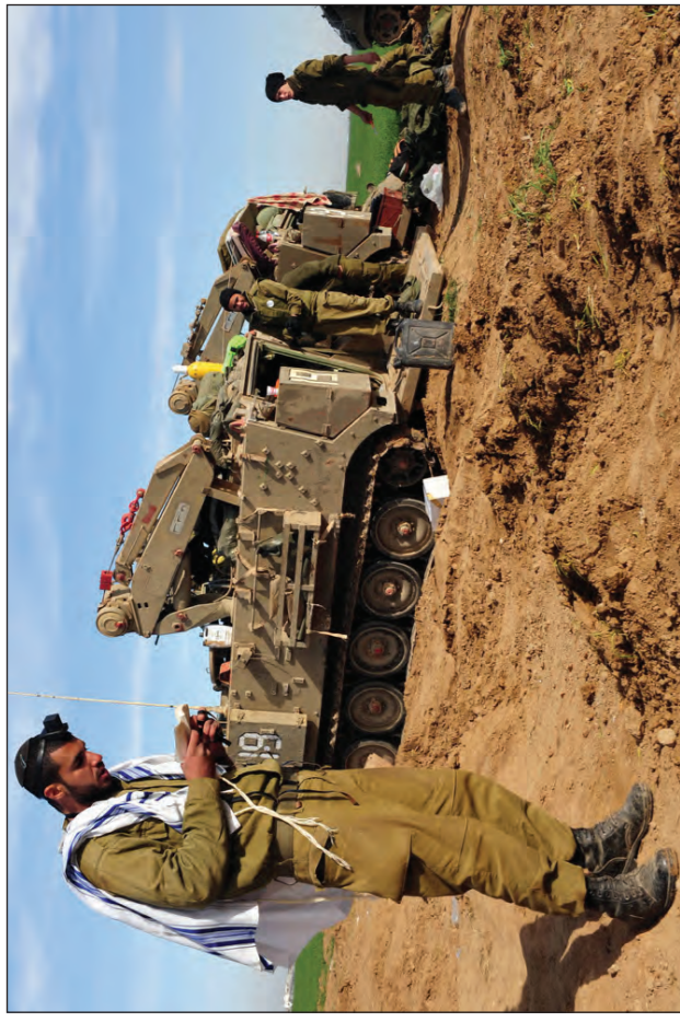
Jewish person praying wearing army clothes and stood by a tank