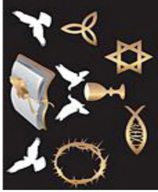
A collation of religious symbols including a holy book, doves, a chalice, a crown of thorns, a Star of David and ICTHUS