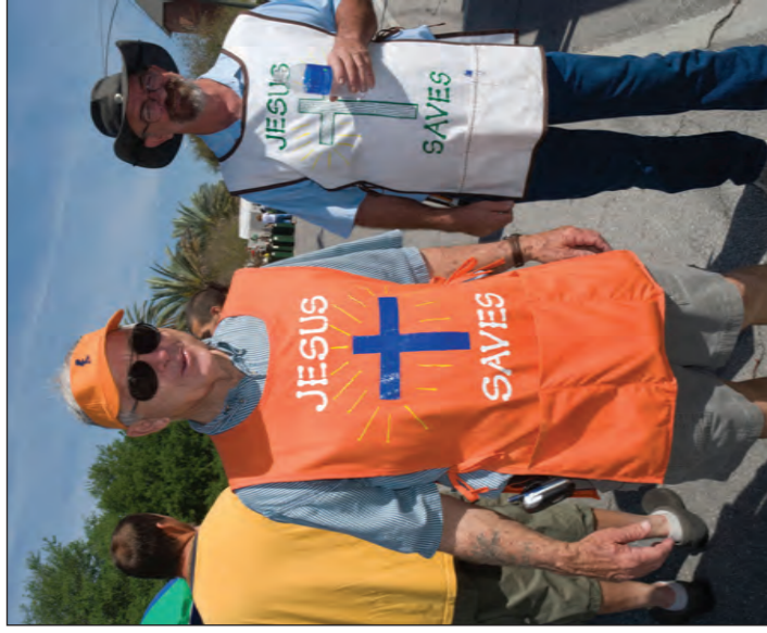
A man wearing a jacket that states 'Jesus Saves' and includes a picture of a cross