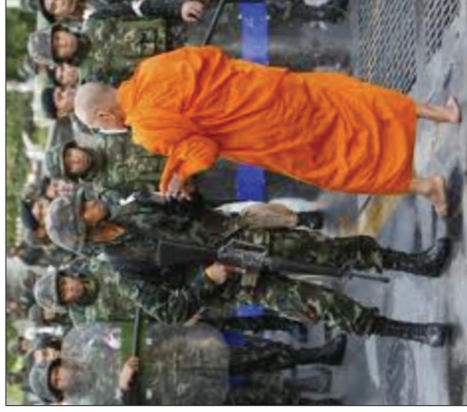
A Buddhist monk protesting in front of an army