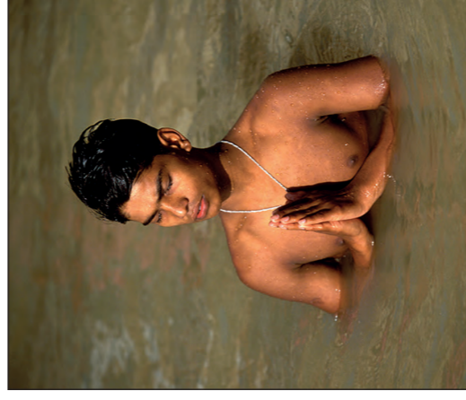
A Hindu praying in water