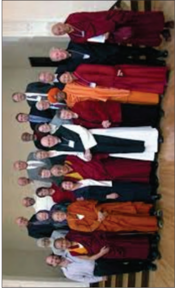
Group of people from different religions meeting together