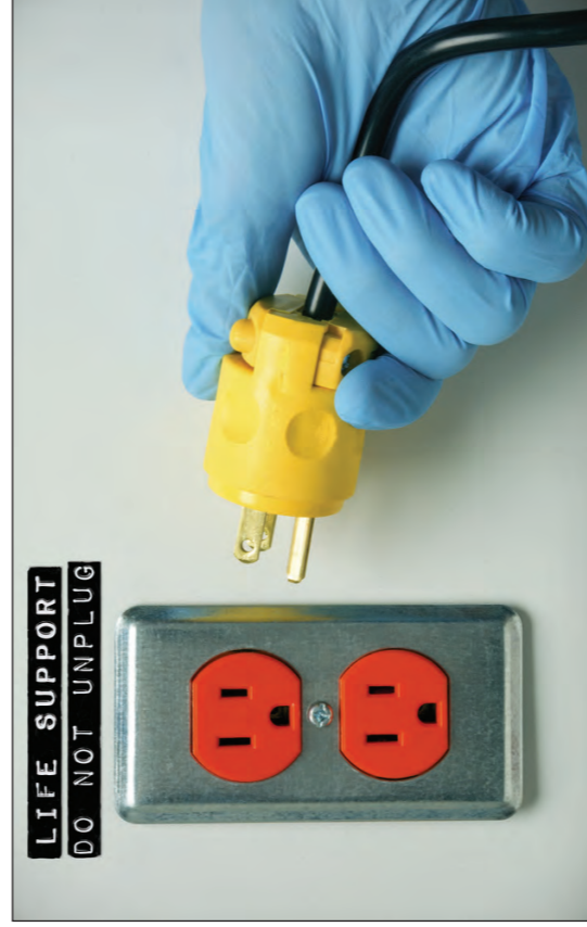
A plug taken out of a socket which says 'Life Support. Do Not Unplug'