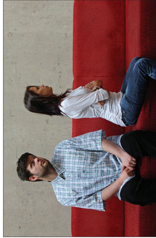
Two people sat on a settee but with their backs to each other