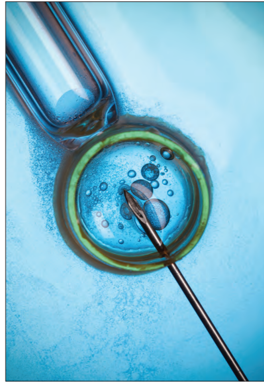
An embryo being fertilised in scientific equipment