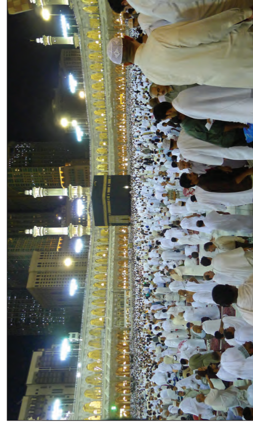
A large number of Muslims circulating a large black cube building