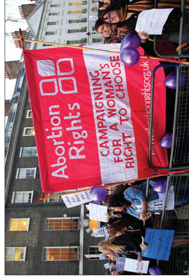
A group of women protesting with a banner saying 'Abortion Rights. Campaigning for a Woman's Right to Choose'