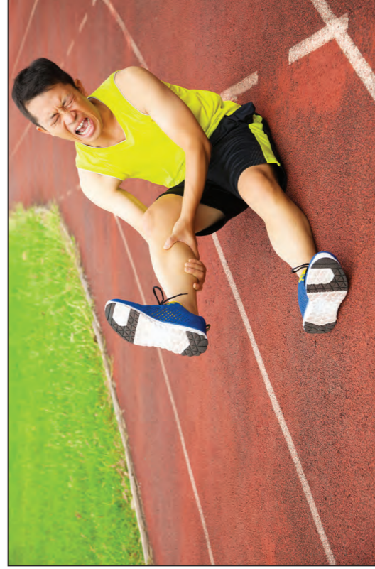
A runner in agony holding a sore leg