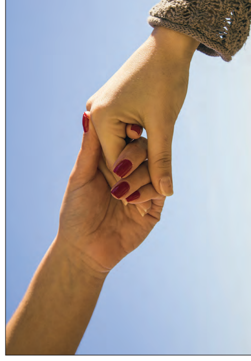
Two hands being held