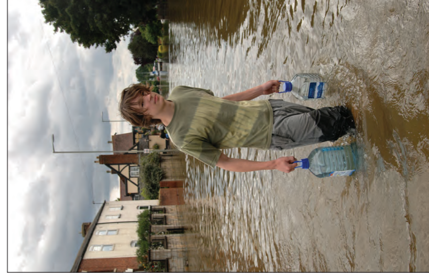
A person wading through a flood