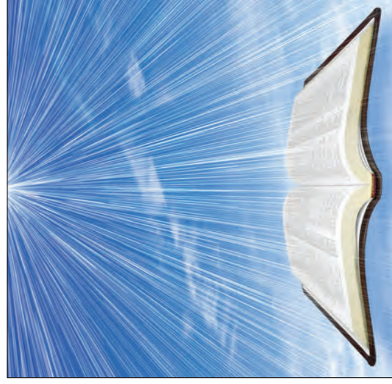
An open book with light radiating on it