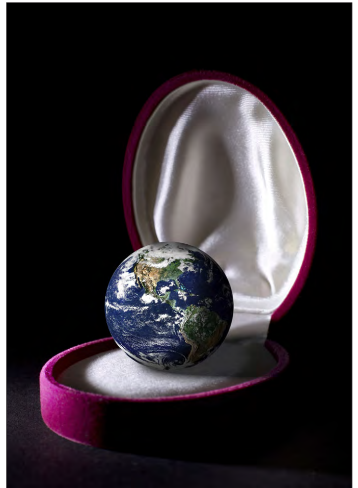
Model of the Earth in a gift box