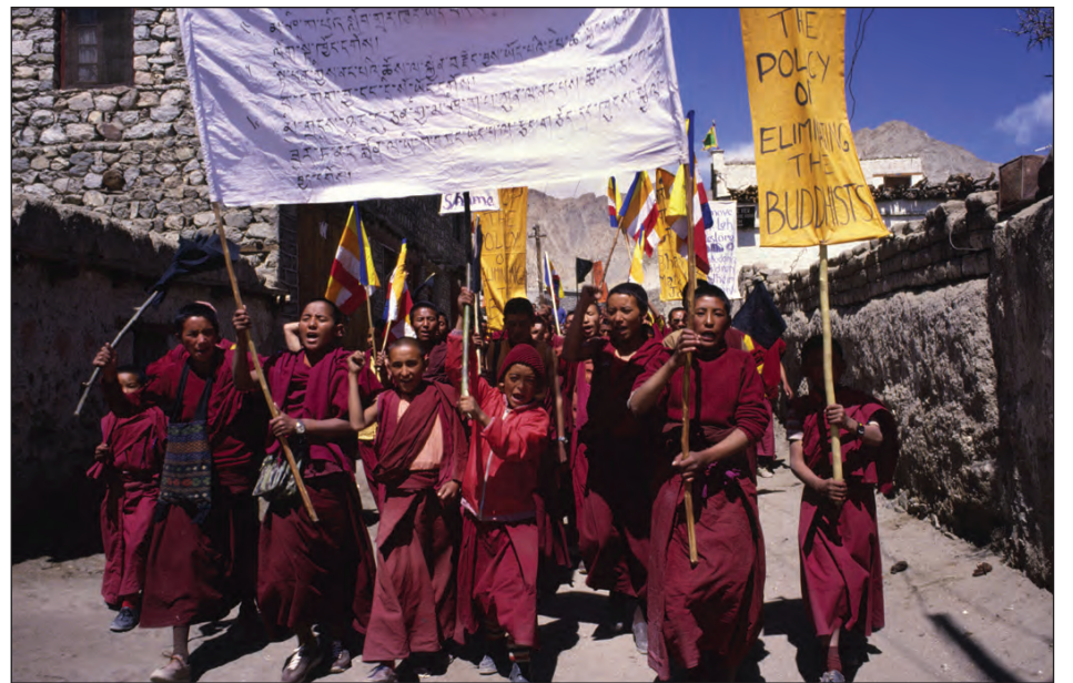
Monks protesting on a demonstration