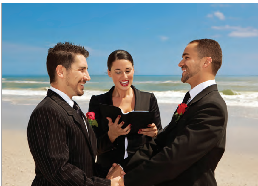
Two men marrying on a beach