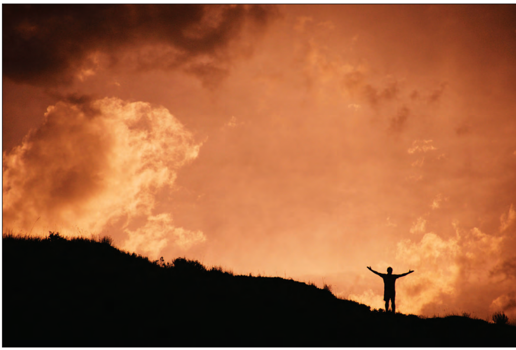
Person standing with arms raised