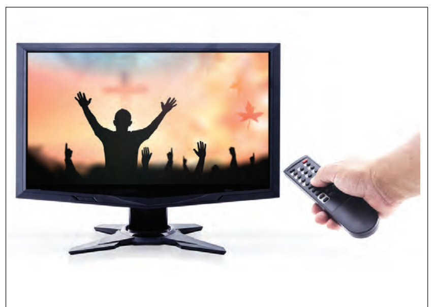
People worshipping in a television programme