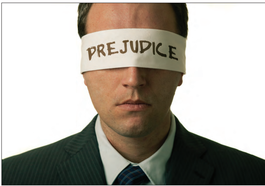
Man wearing blindfold stating 'Prejudice'