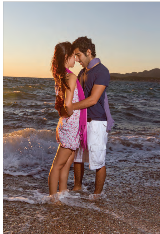
Young couple embrace