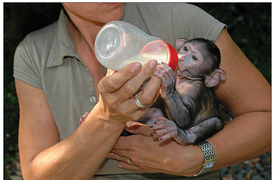
Bottle feeding a monkey