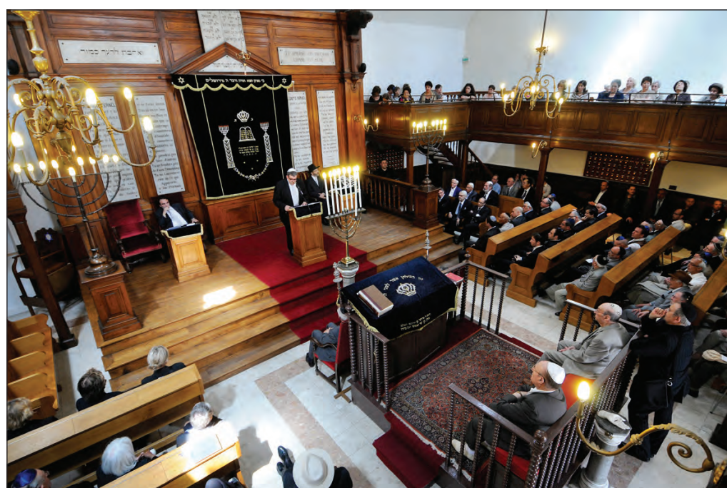
Inside a place of worship