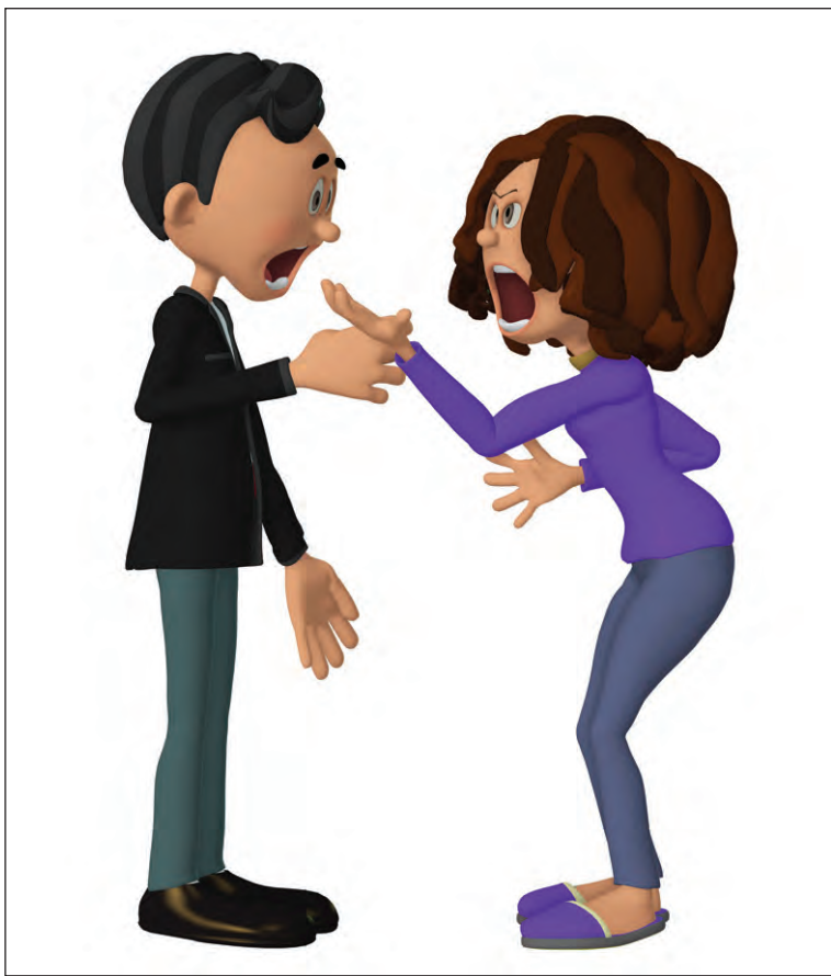
Cartoon man and woman having an argument