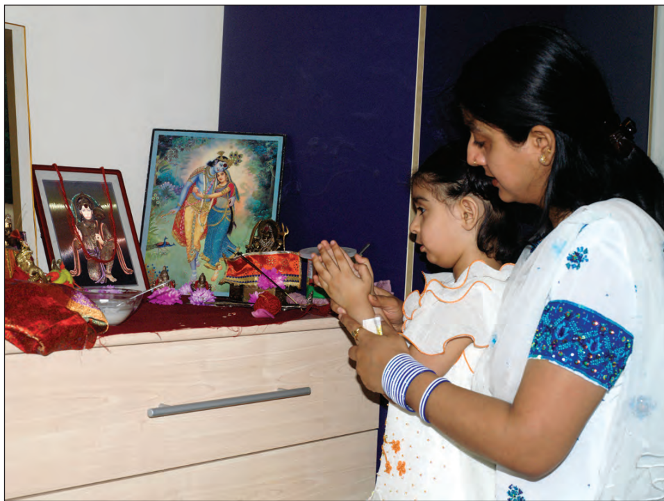
Mother and daughter at family shrine