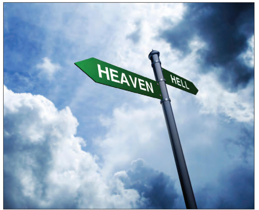
Signpost Heaven and Hell