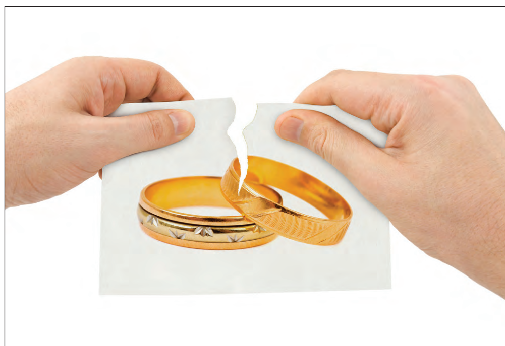
Picture of wedding rings ripped in half