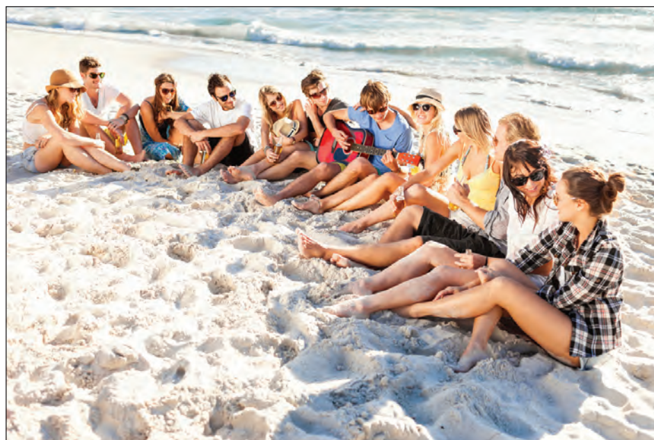
Young people at a beach party