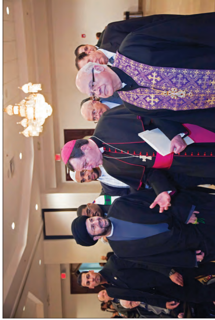
Leaders from different religious traditions