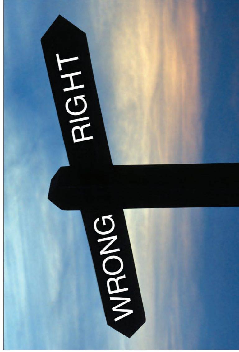
Signpost with the words 'Wrong' and 'Right'