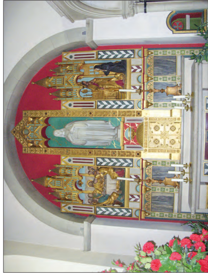
Inside a church