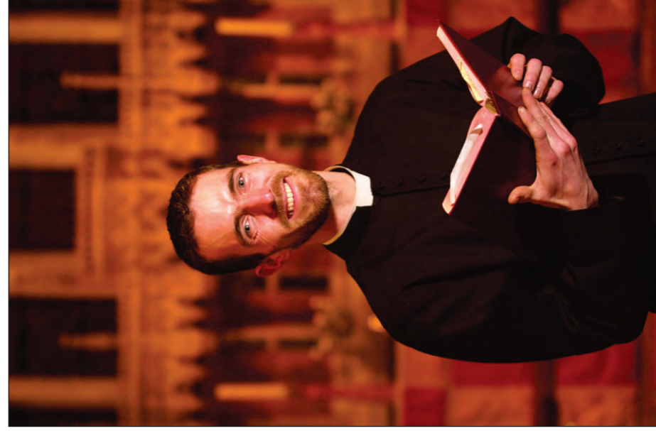
Minister with book