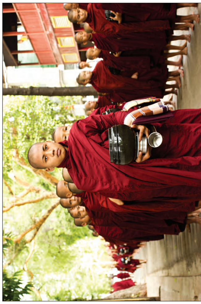
Young men standing in rows with bowls