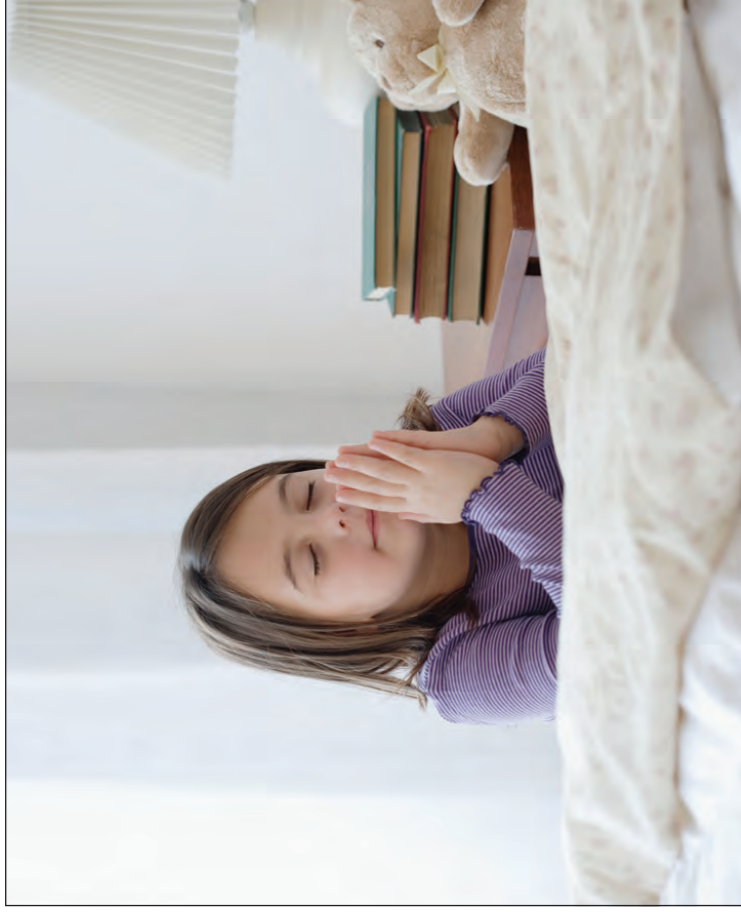
Young child praying at bedside