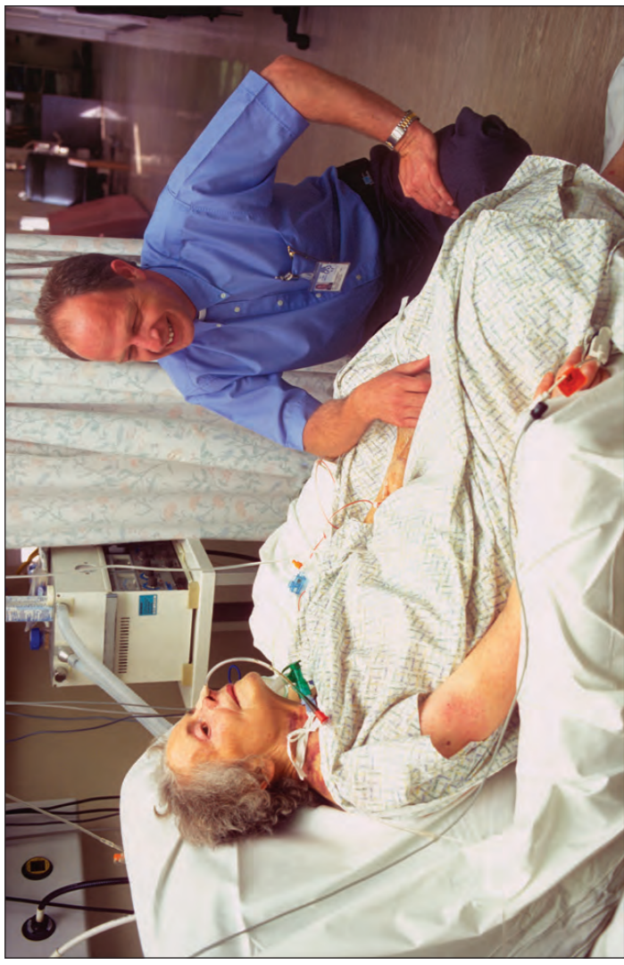
Minister visiting a woman in hospital