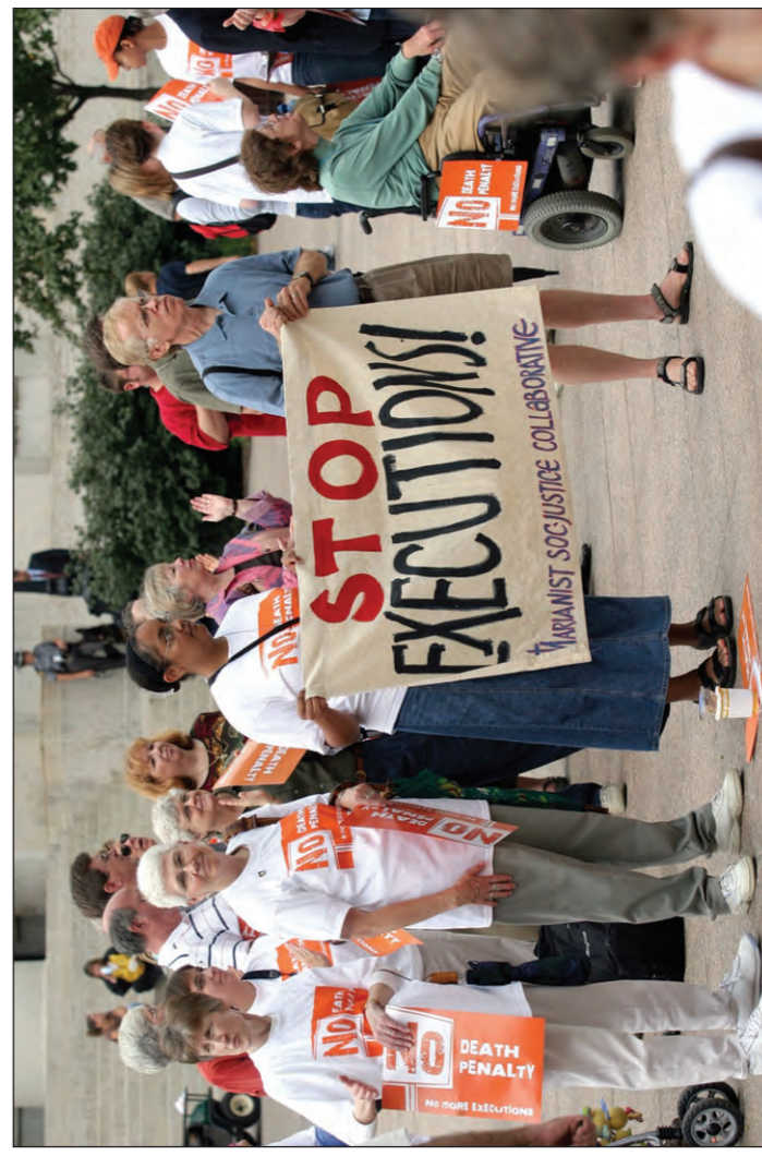
Group of protestors with a banner 'Stop Executions!'