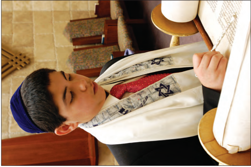
Boy reading sacred text