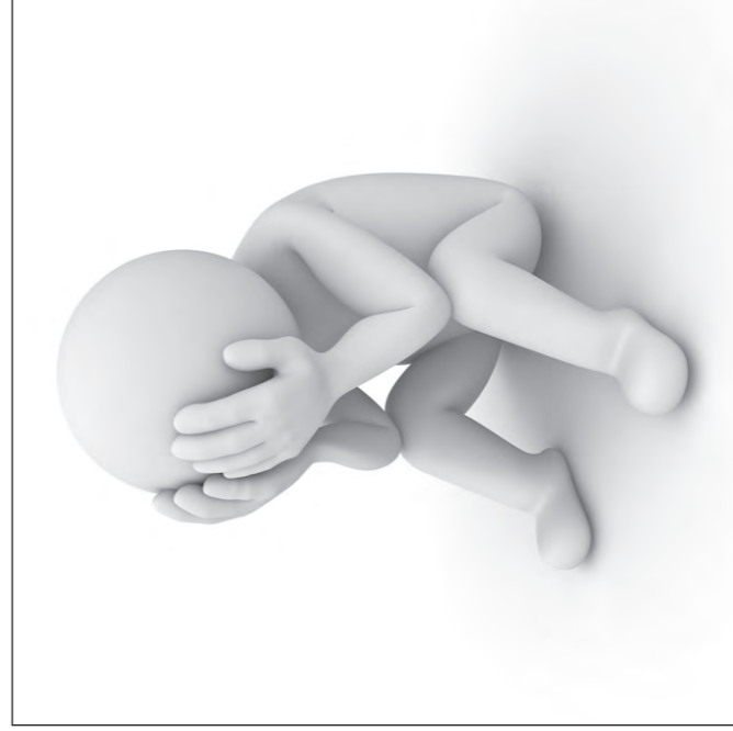
Figure sitting down holding head in hands