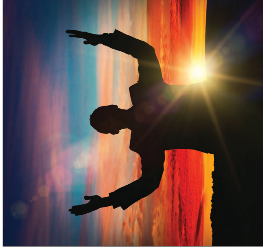
Someone praying at sunrise