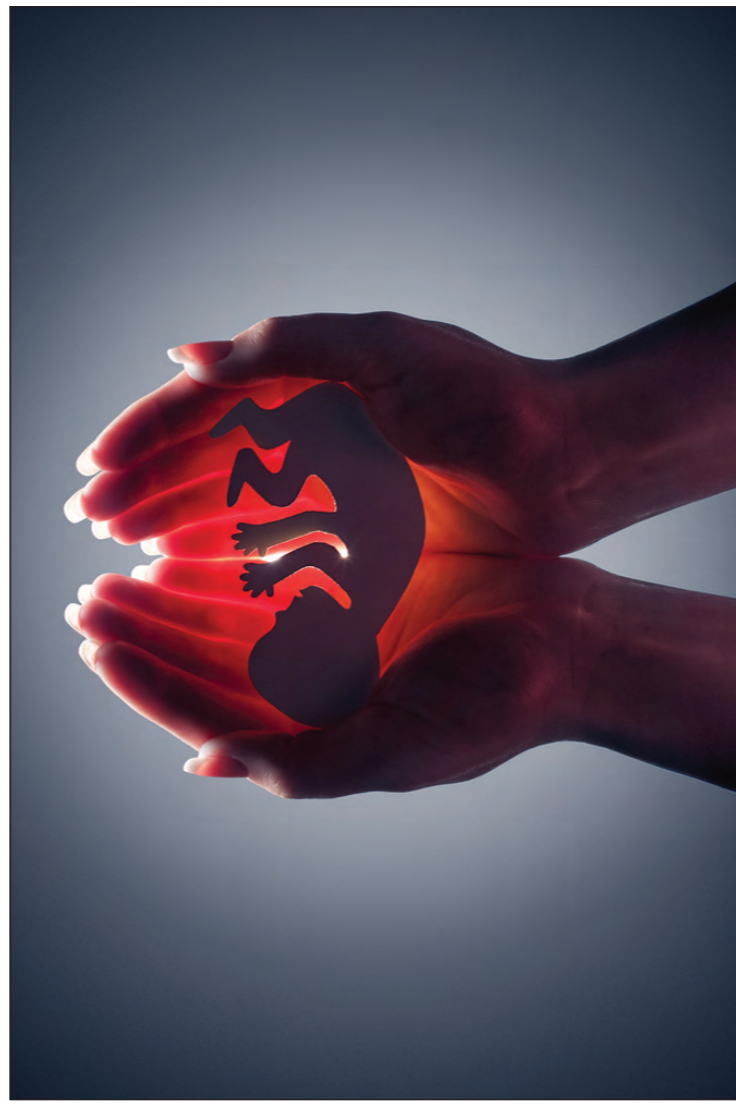
Hands holding shape of a baby