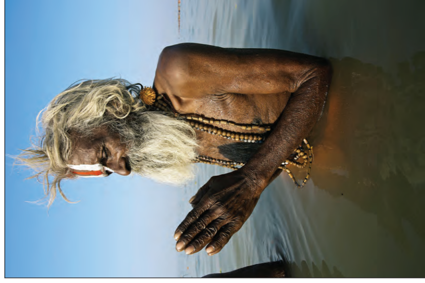
Old man standing in a river