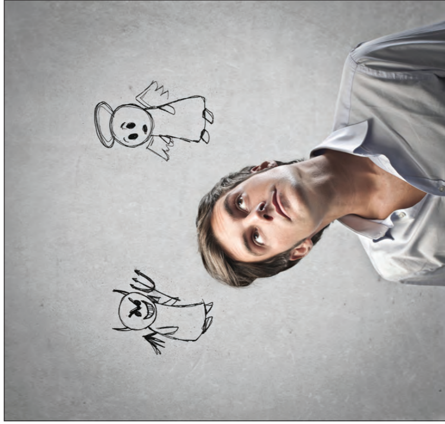
Man looking at an imaginary drawing of an angel