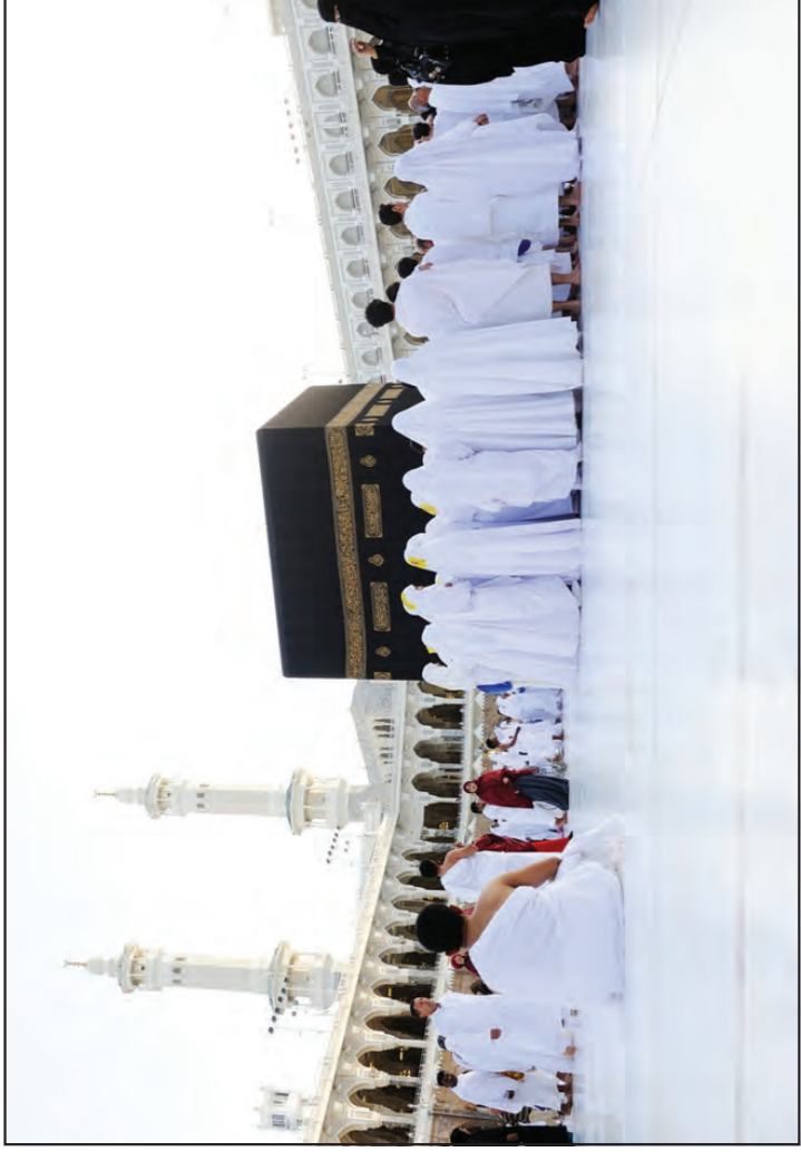
Pilgrims dressed in white