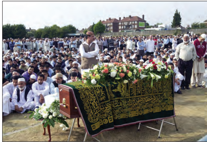
A Muslim funeral in Britain

4. Study the image below and answer the questions which follow.