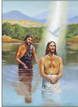
The Baptism of Jesus

1. Study the information below and answer the questions which follow.