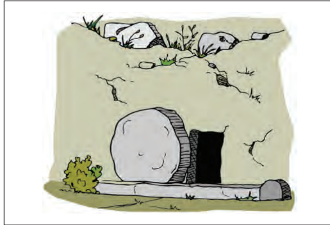
An empty tomb

1. Study the information below and answer the questions which follow.