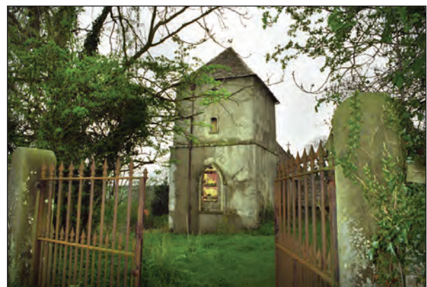
A disused church