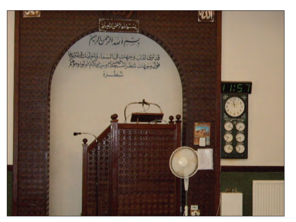
Inside a mosque

1. Study the information below and answer the questions which follow.