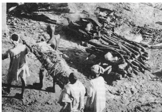
The Burning Ghat at Varanasi