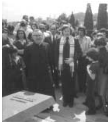
A Jewish burial