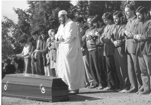
A Muslim burial